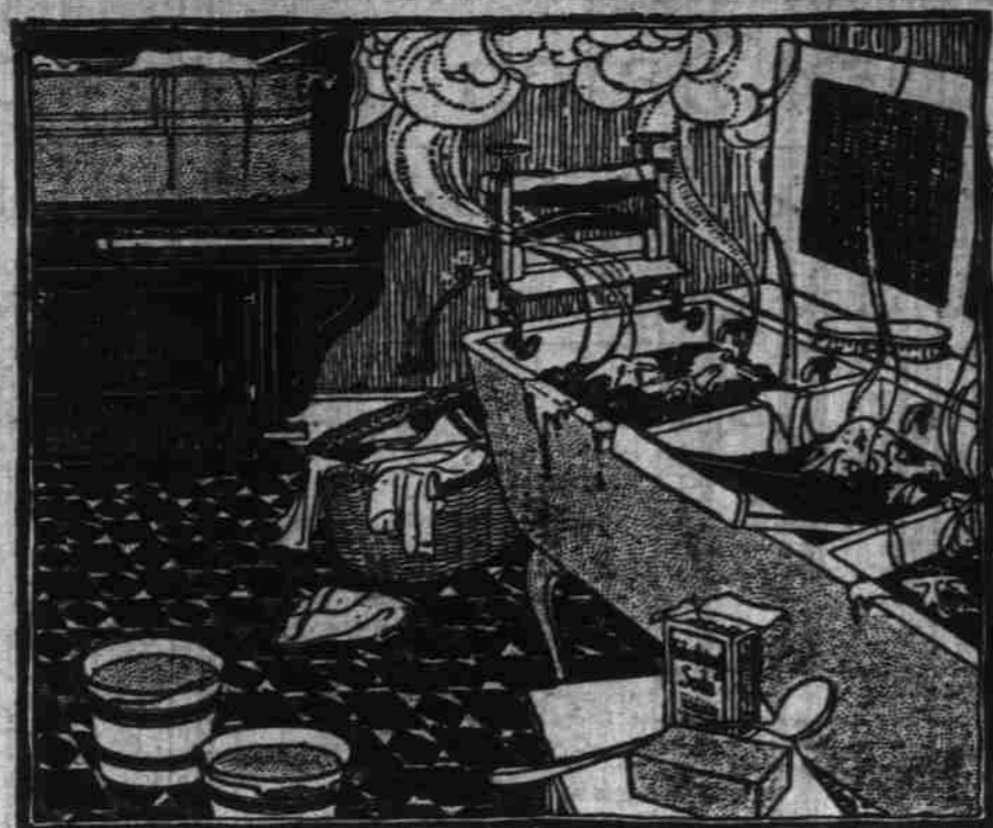
The old way of laundering means a cluttered, steaming-hot kitchen—a dozen different utensils were used