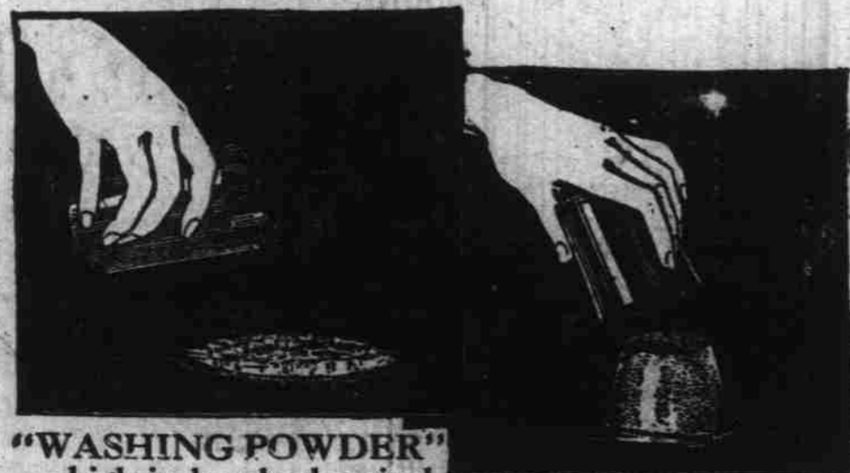
"WASHING POWDER"—high in harsh chemicals—low in soap

The fine granules of Rinso look much like a "washing powder," but—make this test. Use a heaping teaspoonful to a glass of boiling water