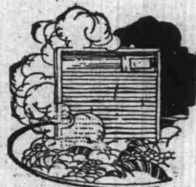
Your clothes wore out this metal washboard—what did it do to your CLOTHES?

You just soak your clothes clean instead of the old rubbing and boiling