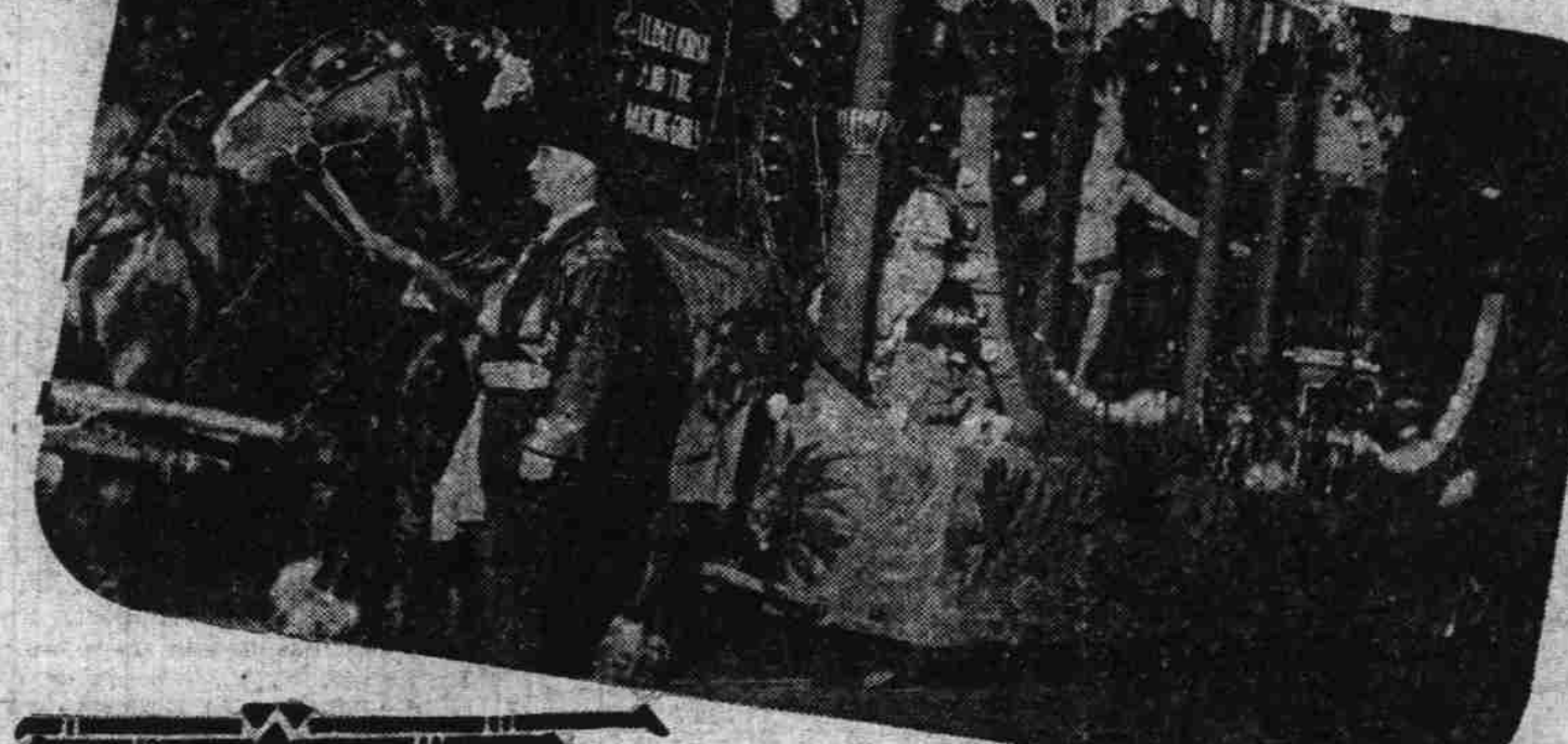
Some of the 15 sparkling, dazzling floats—fairly-like creations—that delighted the greatest parade crowds in the history of Portland as it wound along its three-mile course. Above, left—The Garden of Allah. Right—Aladdin's Dream of Paradise. Center, left—The Arabian Knight. Left—Sheba and the Sphinx. Below—Idexkiosk and the Dancing Girls.

Following Shrine bands participated in the big review: