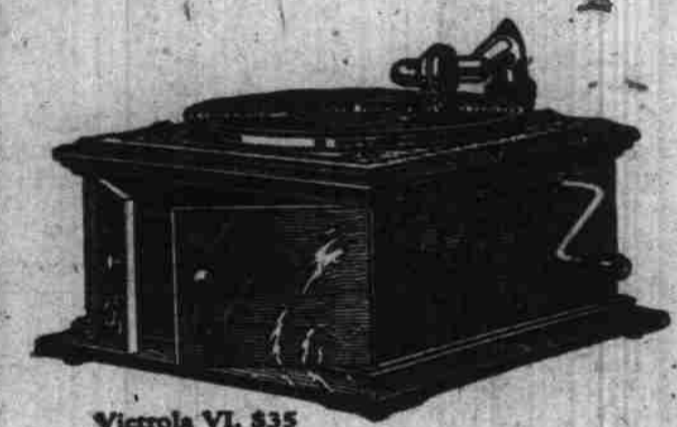
Victrola VI, $35 Mahogany or oak