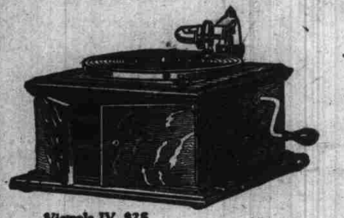
Victrola IV, $25 Oak