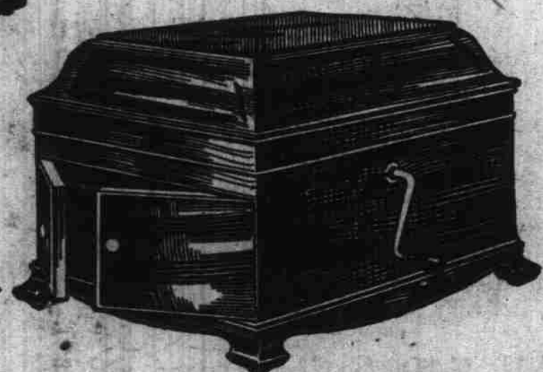
Victrola IX, $75 Mahogany or oak

These portable styles of the Victrola enable you to have the best music whenever you want it, and wherever you want it. You can easily take them on the porch on the lawn on your boat to your bungalow on your camping trip or—anywhere!