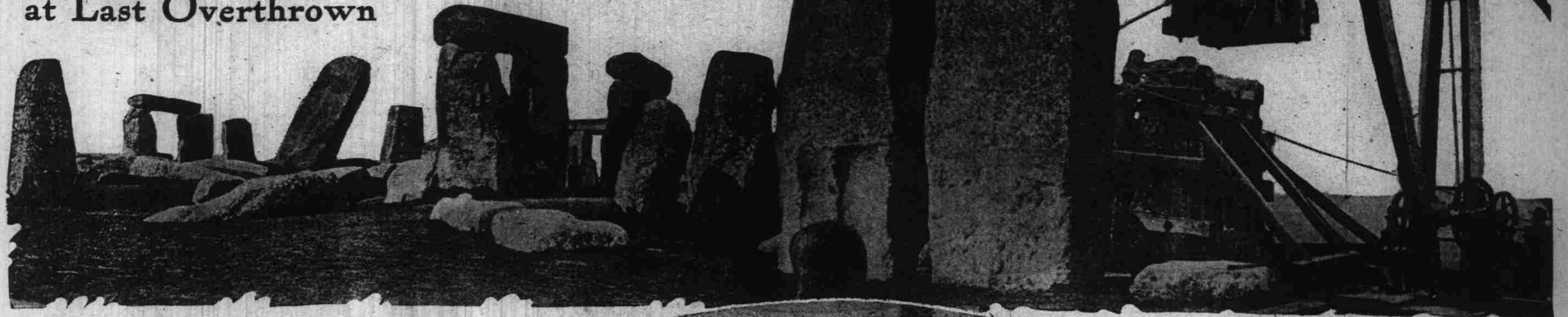
The Ruins of Stonehenge, Showing at the Right One of the Cranes Lifting a Fallen Lintel to Its Old Place on Top of a Pair of Upright Monoliths.

Modern Machinery Puts Back in Place the Massive Stones Which the Old Druid Priests First Set Up with Such Painful Effort and Which Time Had at Last Overthrown