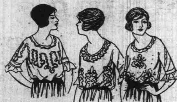
THREE MODELS SKETCHED