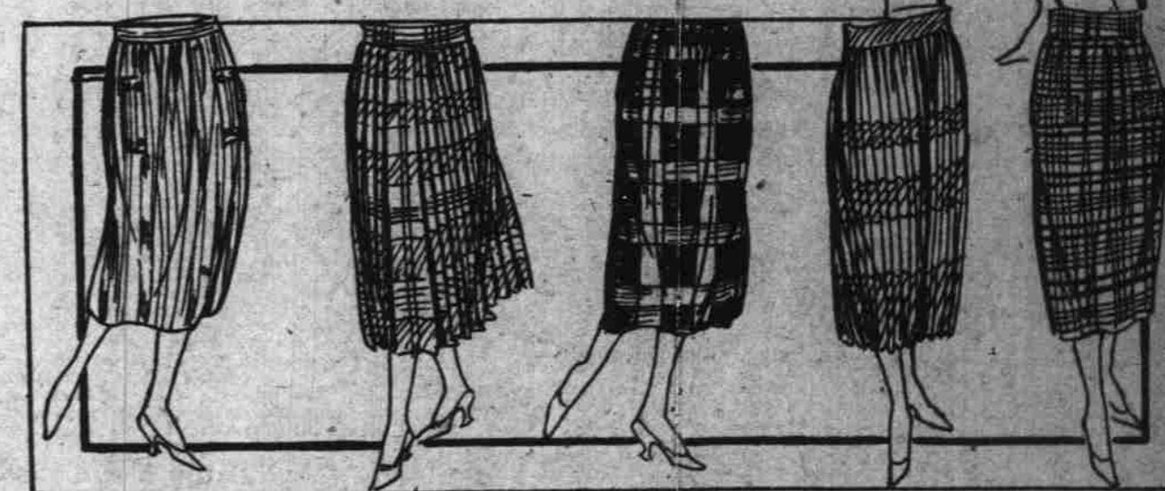
SKETCHED FROM SKIRTS ON SALE