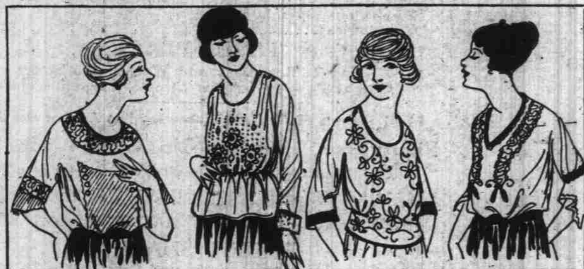
SKETCHED FROM BLOUSES IN THE SALE