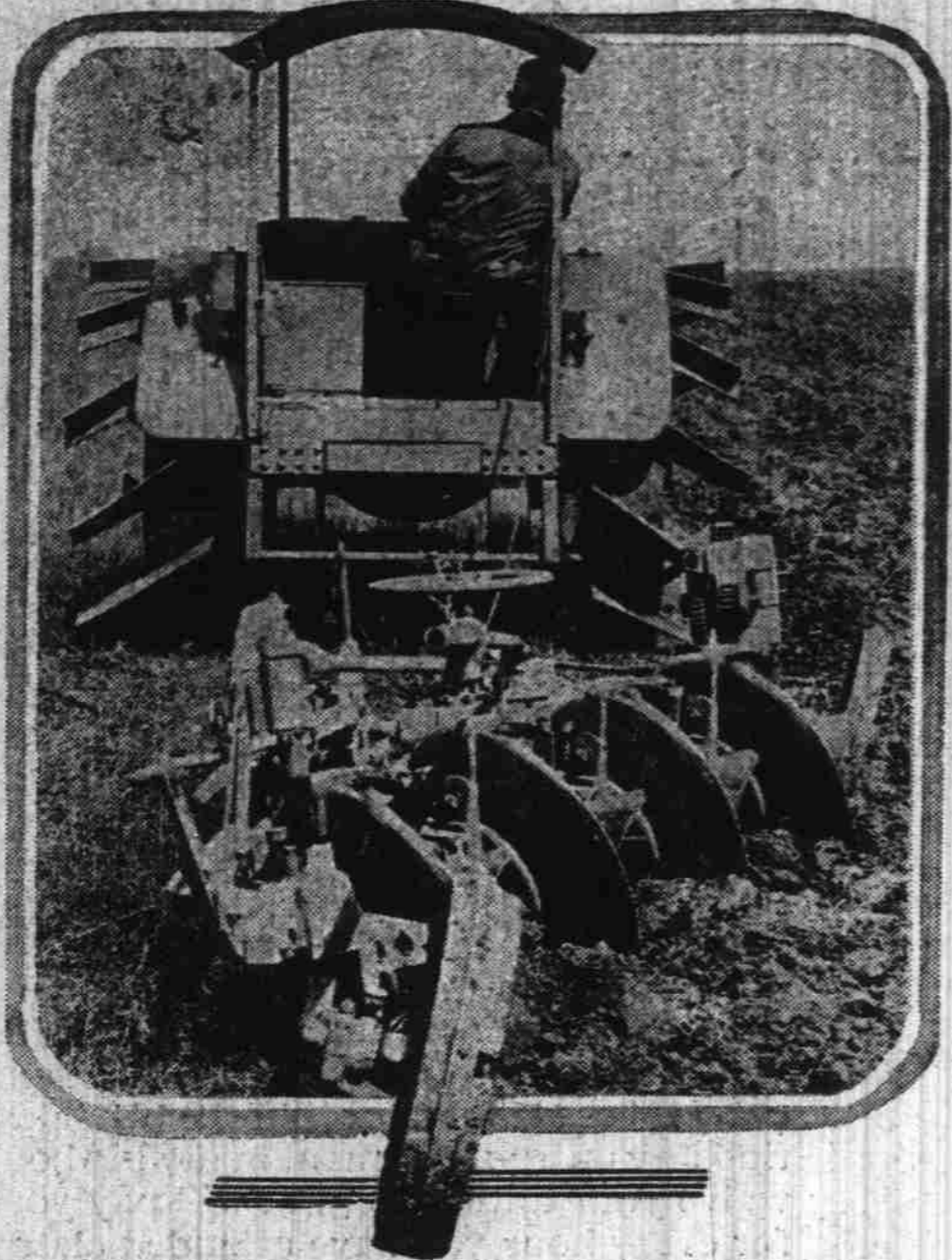
A Russell tractor demonstrating its pulling power with one of the latest disc plows on Eastern Oregon wheat lands.