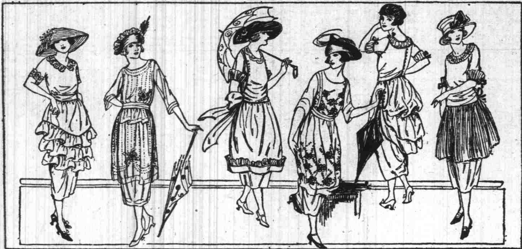
SKETCHED FROM GARMENTS IN THE SALE

—Electric Washing Machine Dept., Seventh Floor, Lipman, Wolfe & Co.