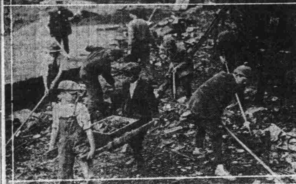
Above—Captains of Women's Ad club starting out to supervise east side cleanup this morning. Below—Lads making rubbish fly

The Italian colony of Portland will celebrate Monday, May 24, proclaimed by Mayor Baker as Italian-American day. The Italian Colonial Federation has taken the necessary steps to celebrate this date with a patriotic man-