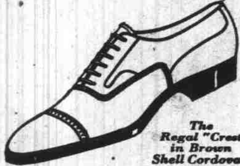
The Regal "Crest" in Brown Shell Cordovan $15.00

An exceptional shoe, considered from the standpoint of design, finish or value. Cordovan is the highest priced leather, making it more surprising that you can find it in a Regal Craft Oxford for $15.00