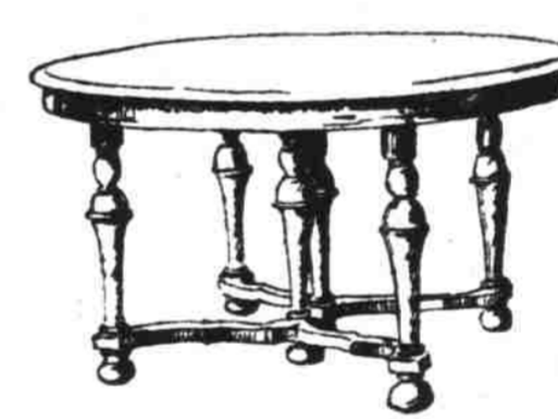
$64 Table $49.50

Mahogany finish William and Mary table, 48-inch top, 6 ft. extension.