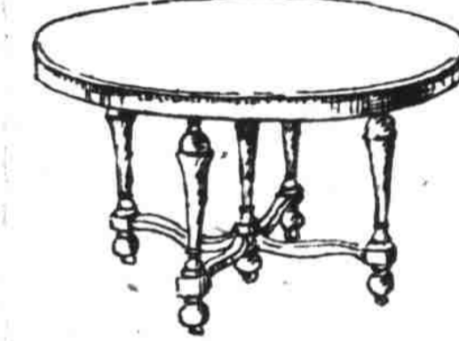
$51.50 Table $39.85

William and Mary oak, 54-inch top, 8 ft. extension.