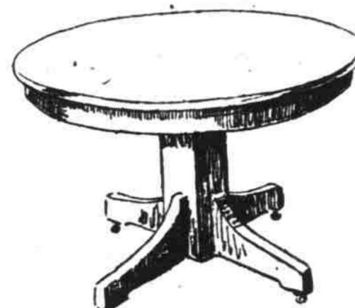
$24.25 Table $15.49

Our customary table orders were given last April. Because of lumber shortage and lack of skilled labor months passed without this factory being able to deliver a single table. The order was duplicated and given to a second maker with the same result of no deliveries. Finally we again repeated the order, giving it this time to a third manufacturer. Then we got deliveries from all three orders! As a consequence the public gets the benefit of these savings on standard merchandise.