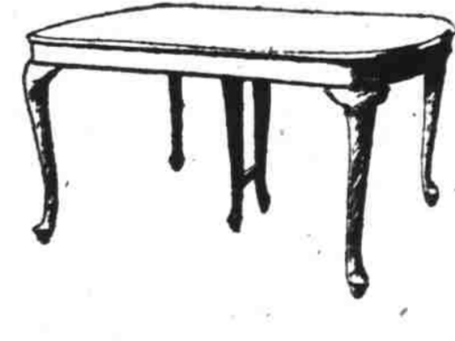
$115.75 Table $99.75

Queen Anne table with 48-inch solid mahogany top, six ft. extension.