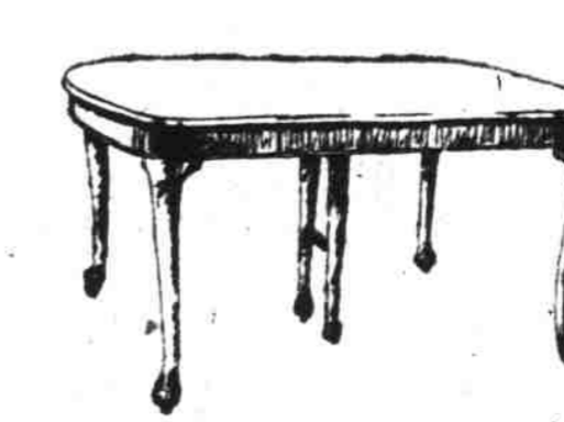
$92.75 Table $73.50

Chippendale style in mahogany, 45x60-inch top, 8 ft. extension.