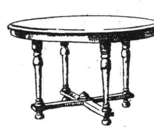
$41 Table $24.50

Waxed golden oak, 42-inch top, six-foot extension.