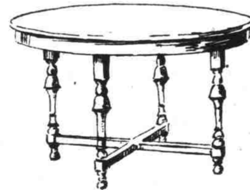
$59 Table $47.50

Imitation mahogany dining table William and Mary style, 45-inch top, 6 ft. extension.