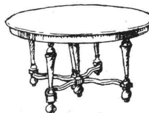
$99.50 Table $69

William and Mary oak, 48-inch quarter-sawn top, six-foot extension.