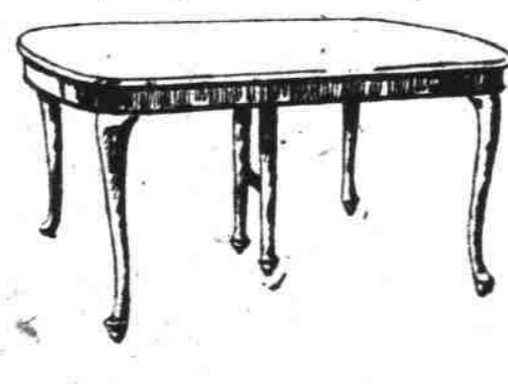
$130 Table $99.50

Mahogany oblong table in the smart rectory style, 45x60 inches.