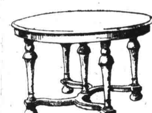
$103 Table $89

William and Mary oak, 48-inch top, 6 ft. extension.