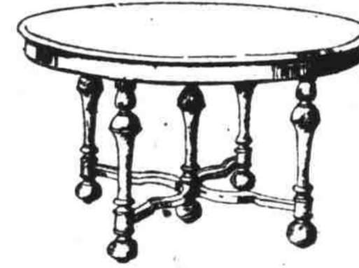
$64.50 Table $49.85

William and Mary oak, 54-inch top, 6 ft. extension. With 8 ft. extension this style is $79 instead of $109.