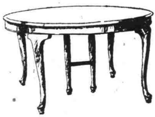
$77.75 Table $64.85

Mahogany table, 54-inch top, 6 ft. extension.