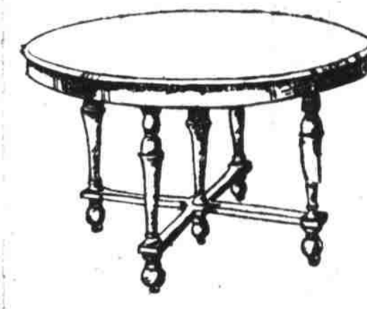
$83.70 Table $59

William and Mary oak, 48-inch top, six-foot extension.