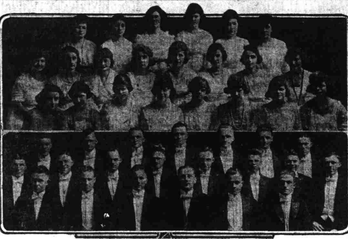
Men's and women's glee clubs of the University of Oregon, who will tour Eastern and Southern Oregon, respectively, during the Easter recess.

University of Oregon, Eugene, March 20.—With the approach of the spring holidays, members of the men's and women's glee clubs are preparing for their respective tours. The men's club will leave Friday, March 26, on a tour of Central and Eastern Oregon. The women's club starts Monday, March 29, on a tour through Southern Oregon.