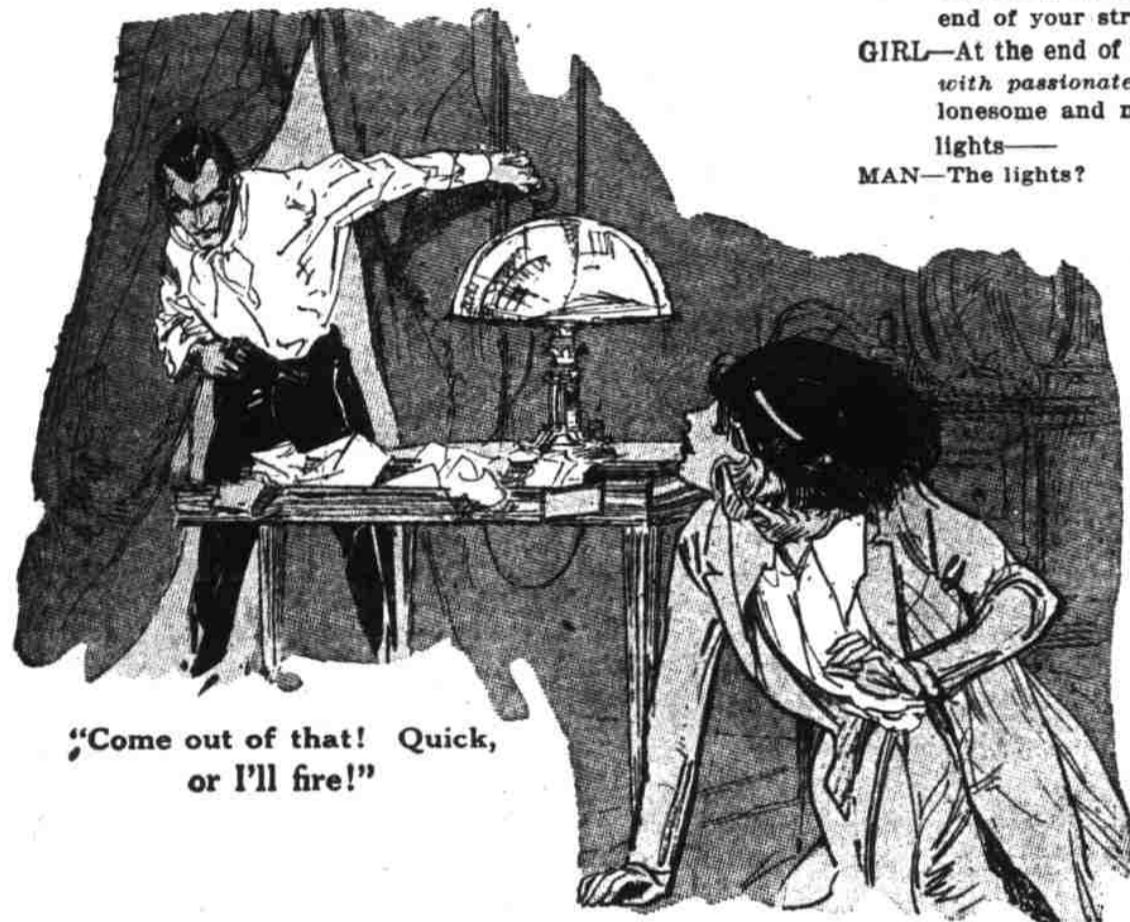
"Come out of that! Quick, or I'll fire!"

(The scene is a tawdry, shabby sitting-room in an old-fashioned boarding-house. As the curtain rises a small, slim girl is vaguely seen rummaging in the table drawer. Next she abstracts a banknote from a dress coat and a crumpled wad of them from a white dress waistcoat, both thrown carelessly over a chair. Throughout all this she is hurried and frightened and works with a breathless intensity. Finally she dislodges a cane, propped against the wall, and it falls to the floor with a bang. Panic-stricken she darts hither and thither, seeking a way of escape, but there is none except through the doorway, beyond which movement is audible. In her desperation she switches off the lamp and crouches behind the table. A moment later the lights flash on and a man is visible, standing beside the doorway. He wears dress trousers, a white shirt and has a white neck-scarf loosely knotted about his neck. He holds a revolver. At the sight the girl gasps and covers on the floor. Detecting her presence the man levels his revolver at her hiding place.)