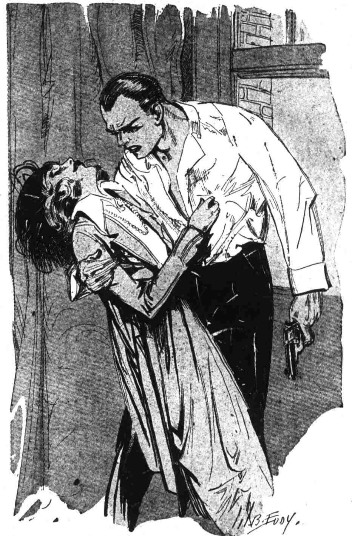
"But I can't go back upstairs and wait and starve! I want my chance! Give it to me! Yes, I'm game!"

GIRL —Oh, I see! It's the Salvation Army. They're marching—