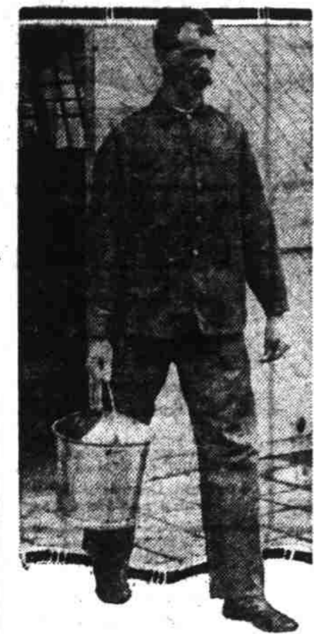
Clean clothes and neat appearance of the milkster leave a good impression upon the visitor.