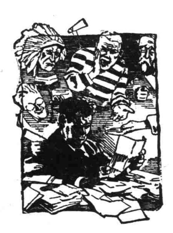
**Help a man once—he's after you for life!** 1 RDUCATE AN INDIAN By WALT MASON See Hearst's for March, Page 50.