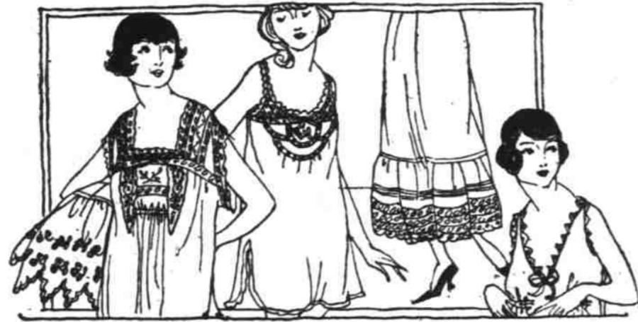
SKETCHED FROM GARMENTS IN THE SALE

—The closing days of our most successful year are to be most eventful. This page details some of the attractions throughout the store.