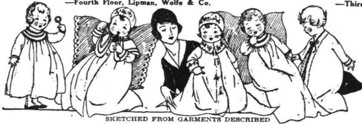
SKETCHED FROM GARMENTS DESCRIBED