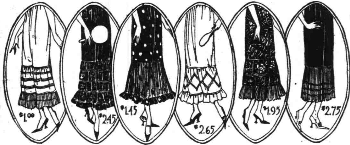
Sketched From Garments in the Sale.

have we in any one sale announced so many special offerings which were so extremely underpriced, even to the extent of being under, and very much less than the prevailing wholesale prices.