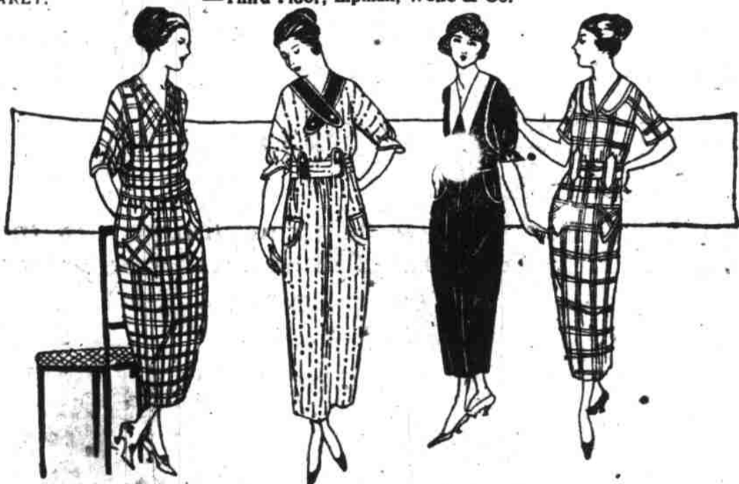
SKETCHED FROM GARMENTS IN THE SALE