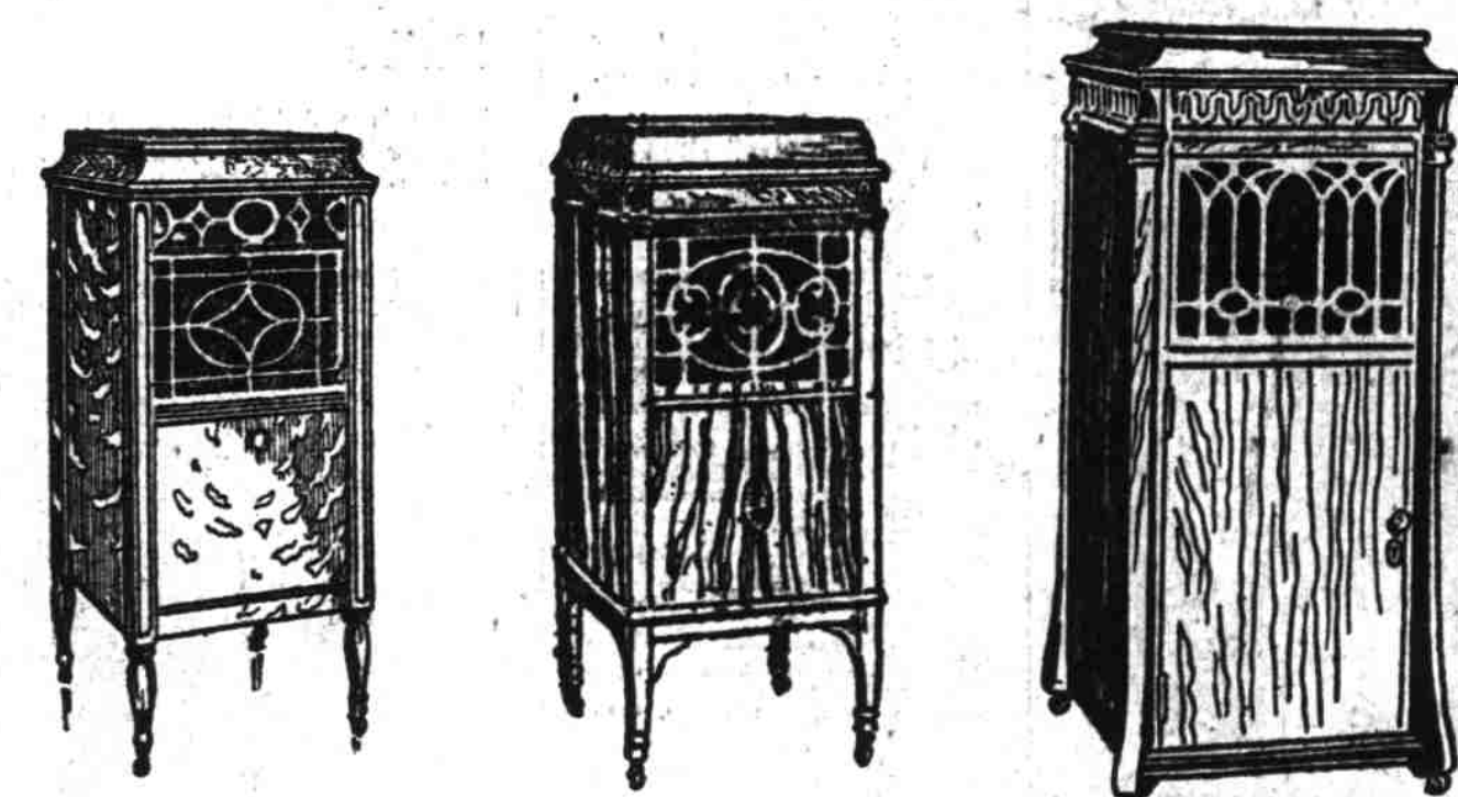
The NEW EDISON Sheraton $200 The NEW EDISON Adam $220 William & Mary or Chippendale $295

You want the BEST phonograph you can buy—the one that will give you the world's best music—this Christmas and all your life. Hear The NEW EDISON at our store tomorrow—then decide.