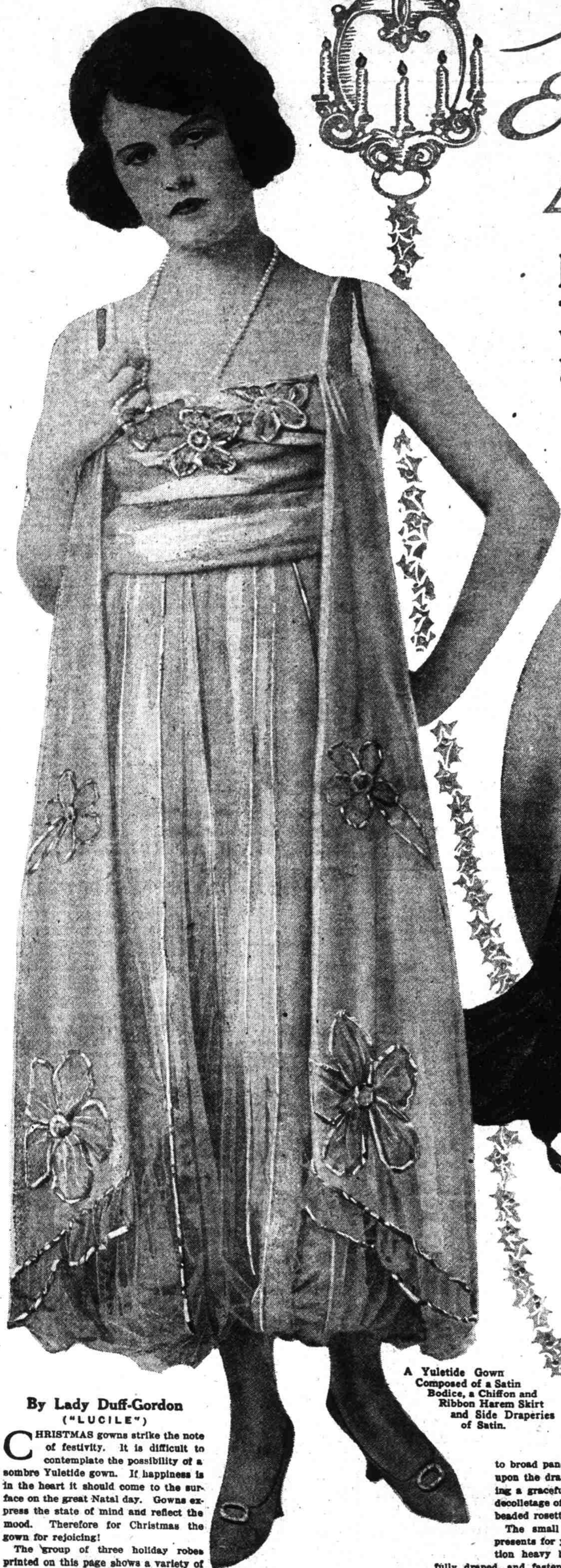
By Lady Duff-Gordon ("LUCILE")

LADY DUFF-GORDON, the famous "Lucile" of London, and foremost creator of fashions in the world, writes each week the fashion article for this newspaper, presenting all that is newest and best in styles for well-dressed women. Lady Duff-Gordon's Paris establishment brings her into close touch with that centre of fashion. Lady Duff-Gordon's American establishments are at Nos. 37 and 39 West Fifty-seventh street, New York, and No. 1400 Lake Shore Drive, Chicago.