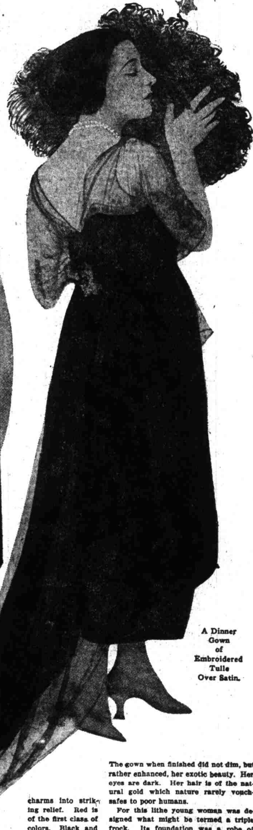
A Dinner Gown of Embroidered Tulle Over Satin.

Brown was most happily utilized in an epochal gown I recall that was ordered by a lovely young woman. Although the Autumnal age was far from her, her taste inclined to Autumnal colors. She asked for a dancing frock that should resemble as nearly as possible the shades of a forest in Autumn.