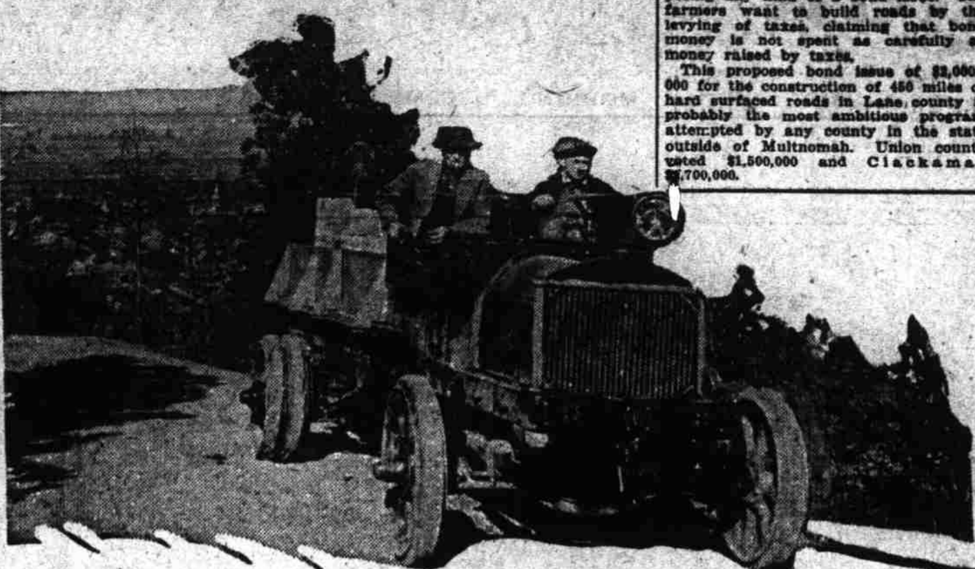
It is a fair guess that this road in Southern Oregon has changed a bit with the recent snows, but reports come in that the Federal 3 1/2 ton truck, which is used for hauling ore from Blue Lodge mine to Jacksonville, is still on the job.

known bolling point for traffic cops. Double