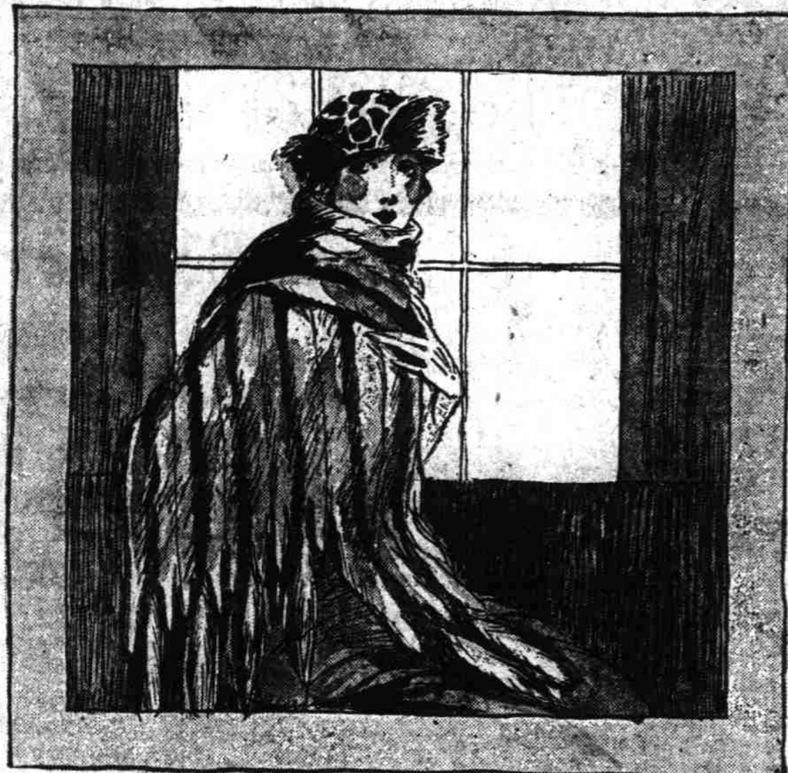
—Sketched in the Lipman, Wolfe Studios

Without Reservation or Restriction We Announce Beginning Tomorrow