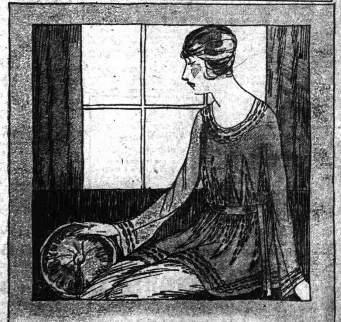
—Sketched in the Lipman, Wolfe Studios.

THIS STORE USES NO COMPARATIVE PRICES—THEY ARE MISLEADING AND OFTEN UNTRUE