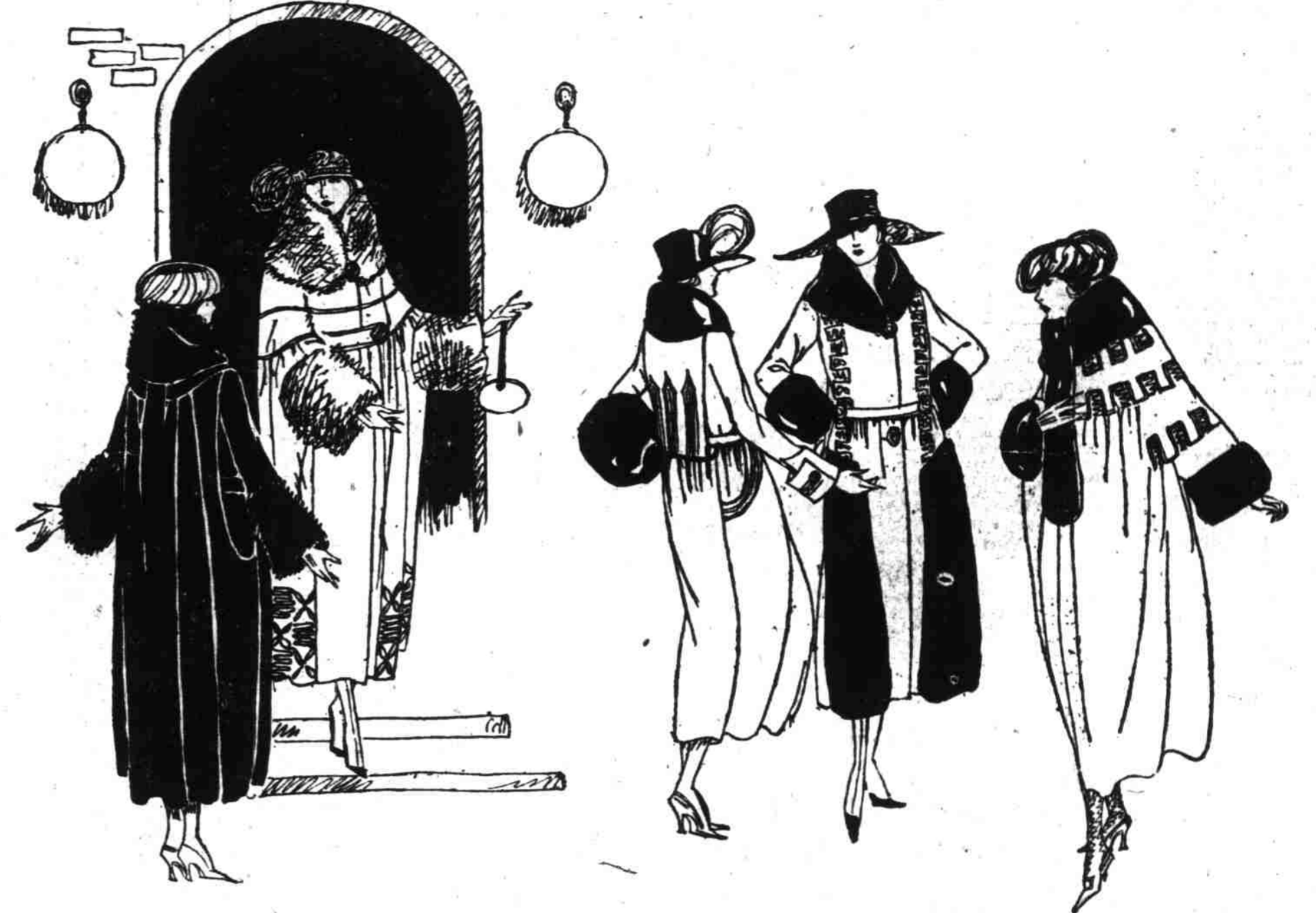
SOME OF THE STYLES SKETCHED IN THE LIPMAN-WOLFE STUDIO.

H ERE is the announcement that hundreds of fashionables have been awaiting. No doubt you have one of the beautiful coats in our stock in mind—one that you had hoped to own before long. Just by way of emphasis, allow us to say that probably a dozen other women have approved your good taste and might be waiting for that very coat. Need we say, "Come Early"?