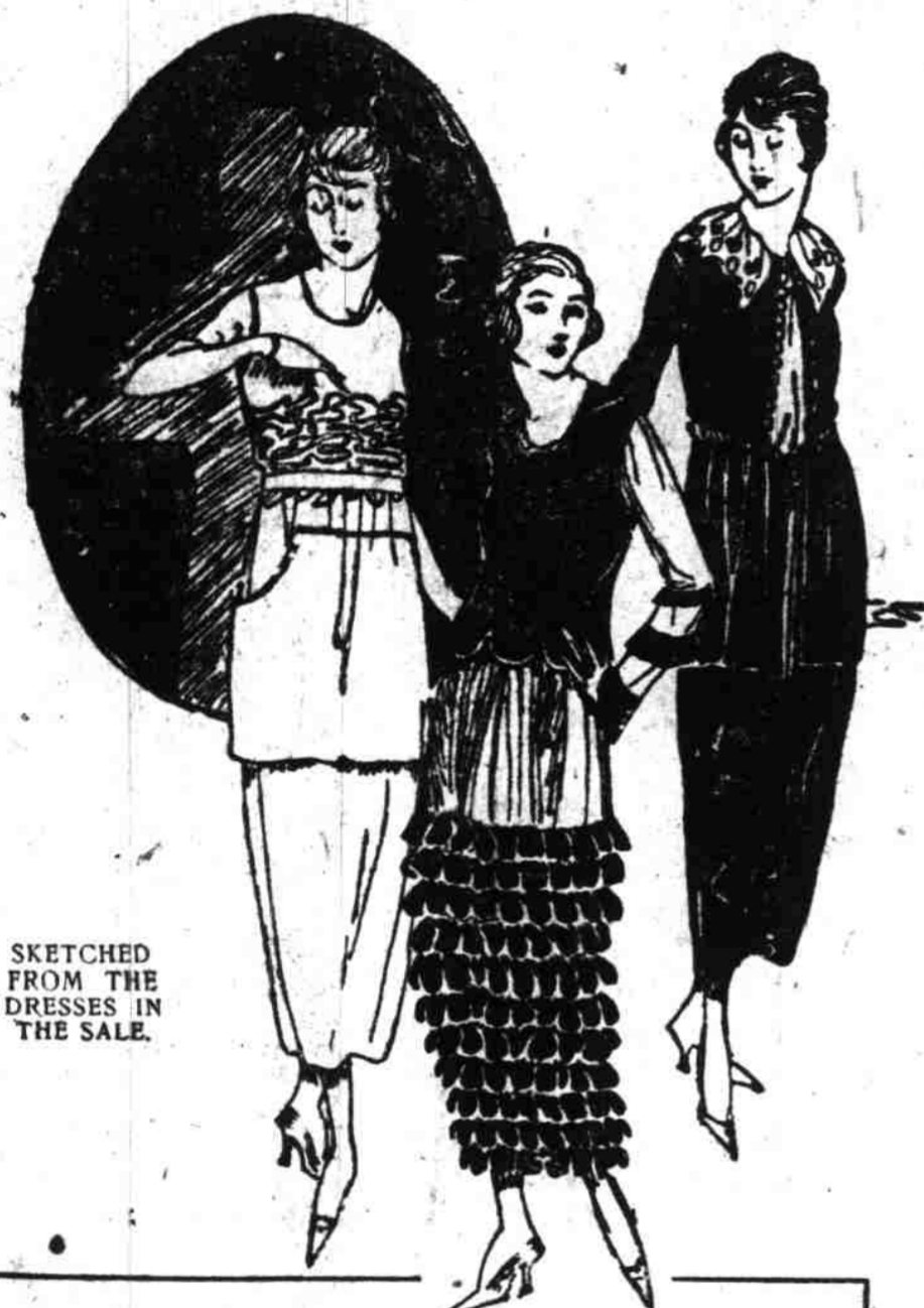
SKETCHED FROM THE DRESSES IN THE SALE.

Hundreds of Latest Silk and Wool Dresses Reduced to $18 00