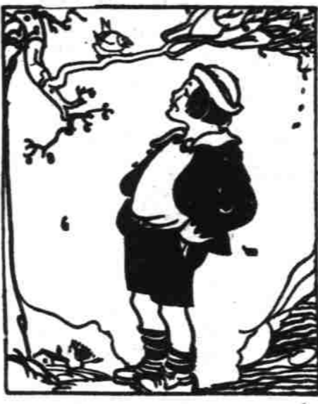
"Oh, King! Oh, King!" cried the Sparrow, "some one has stolen your throne."

TINKER BOB found Chief Porky filling himself on the bark of a saasafraz tree. It wasn't the best season in the year to eat saasafraz, but Mr. Porcupine felt that his blood was too thick and he needed a tonic.