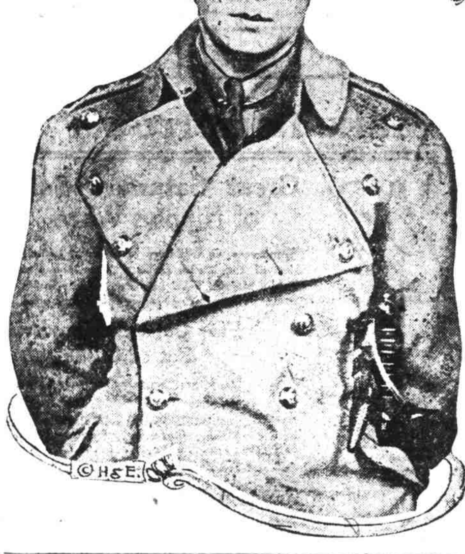
lecture Tuesday night. The Daughters of the British Empire are arranging a reception for her.

Mrs. Pankhurst in Spokane Spokane, Wash., Nov. 21.—(U. P.)—Mrs. Emmeline Pankhurst, noted British suffragette, arrived here today from Billings, Mont., and is scheduled for a