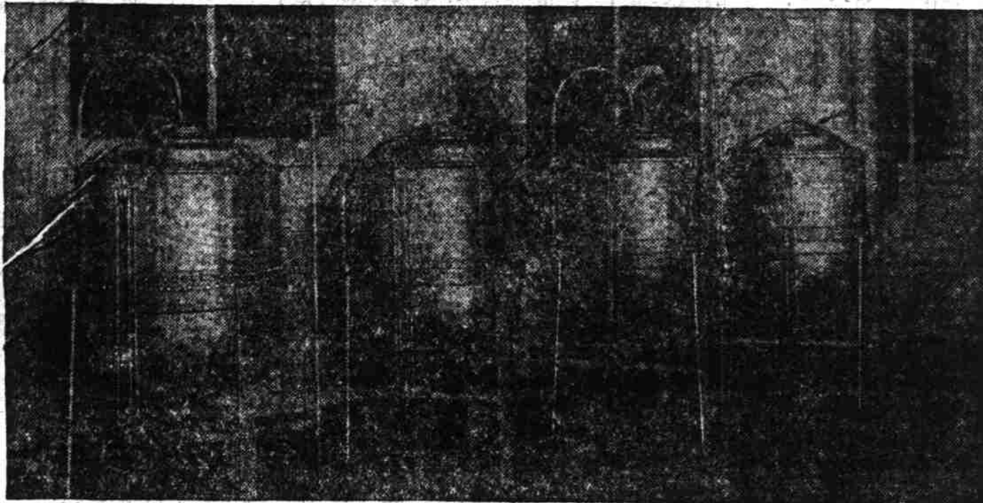
"Wear-Ever" Liberty Coffee and Tea Urns U. S. Debarkation Hospital No. 3—New York City