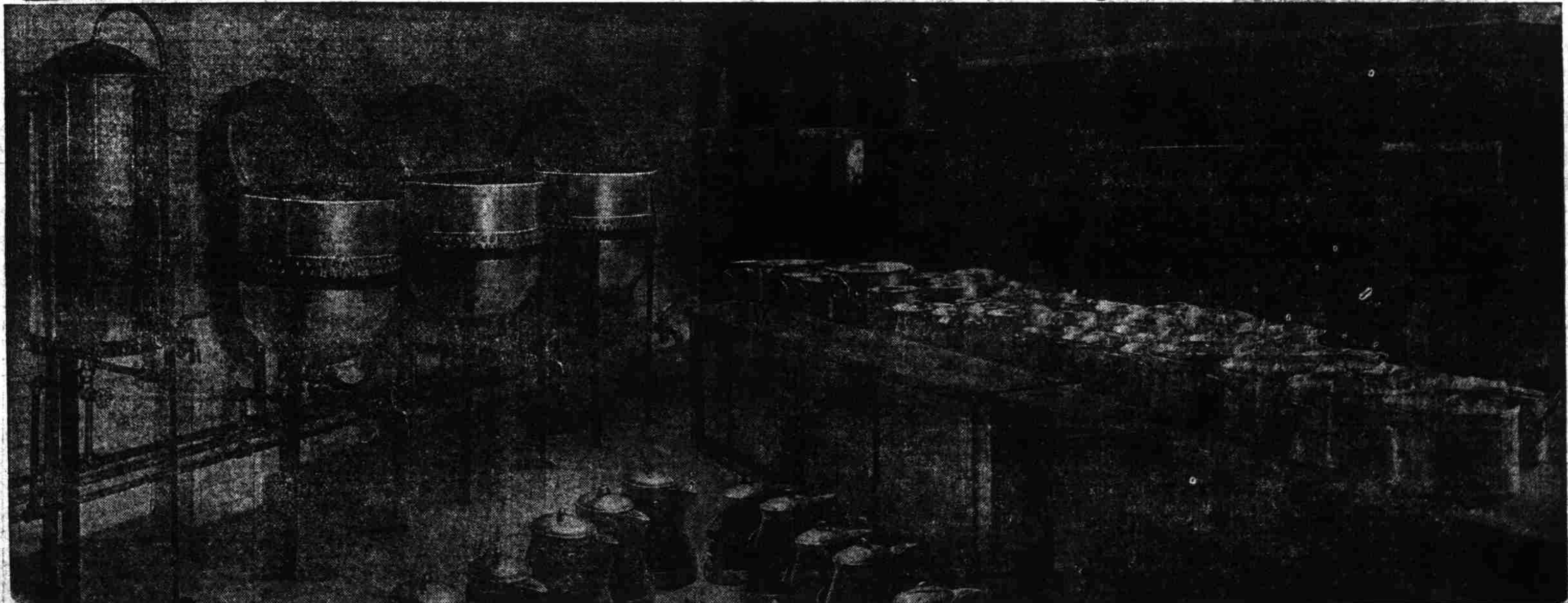
"Wear-Ever" Equipment Letterman (U. S. A.) General Hospital San Francisco, Cal.