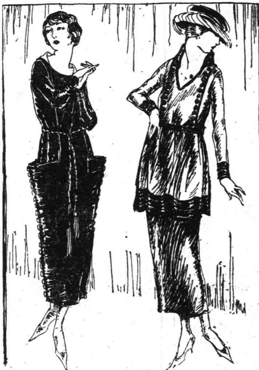
Description of the Two Sketched Above

—These frocks of simple lines and exquisite lack of "fussiness" represent VALUE right down to the last detail. Lipman-Wolfe value is represented in the style, quality, niceties of finish, excellence of workmanship and beauty of fit. There will be, we are sure, a surprising lack of alteration, for they are designed to fit, as nearly as is possible for made garments—the woman whose size they are made for. And there are all sizes in the collection.