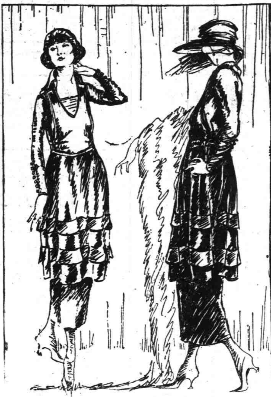
Description of the One Sketched Above

—This is an event in which the smartest dressed women in Portland will participate. An event that is of great importance to all women seeking that rare combination of style, quality and value.