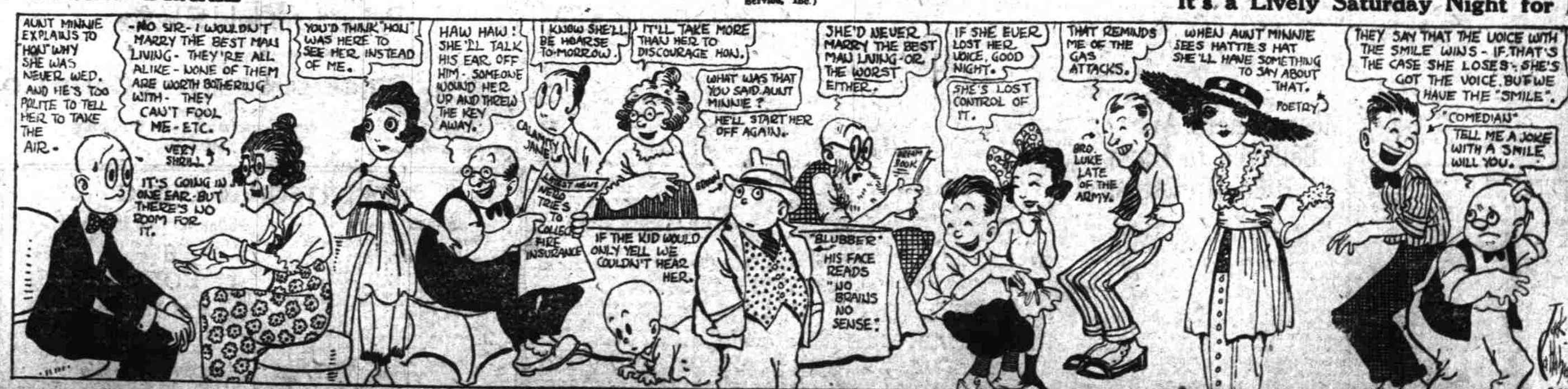
It's a Lively Saturday Night for Hon