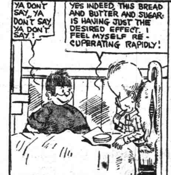
Another Moral Is, Don't Sing So Loud