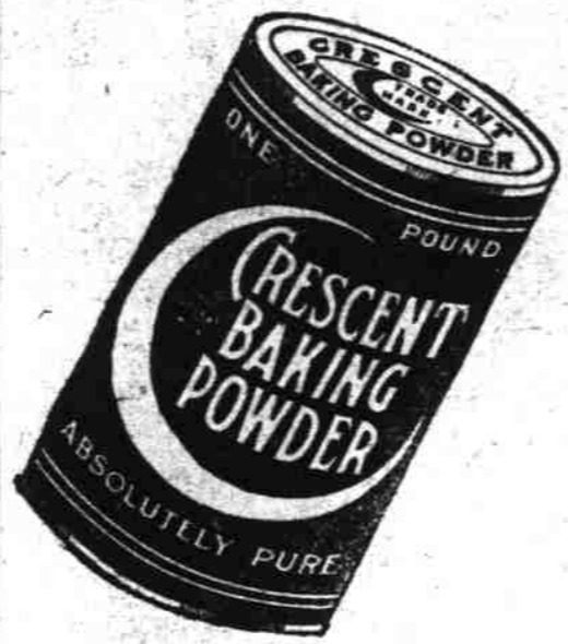
CRESCENT MFG. CO. Seattle, Wash.