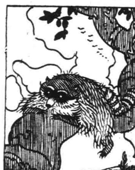
Jimmie Coon felt worried and wondered if Chatterbox knew anything about the door into the hall that he had made.

Chatterbox looked everywhere and at last he found the new door into the hall of the Porcupine house and then he knew how the rascals had gotten in and what had happened. Before the day was over all those little rascals came sneaking back again, to try and get in and see if there could be a crumb left. Chatterbox ran back and forth in the tree tops and talked and grumbled and seemed very excited about something, but nobody could tell what he was talking about. Jimmie Coon felt worried and wondered if Chatterbox knew anything about the door into the hall that he had made. but he wanted to get a little more lettuce so that he would be sure and have enough for old Mrs. Rabbit, and he thought he would try and have one more fish—for he said he was so fond of you, Jimmie Coon, and it would be dreadful not to have enough! Jimmie Coon swallowed hard when he heard what Quilly had said and he felt ashamed of himself for taking those little animals into the cellar and eating all the nice things on the pantry shelves when Quilly had worked so hard. "Come on, Teddy Possum, I'm sorry. Let's go and get something nice for Quilly and make up for all those things we have taken. I'm glad he doesn't know what we have done." Tomorrow—Jimmie Coon Does the Right Thing.