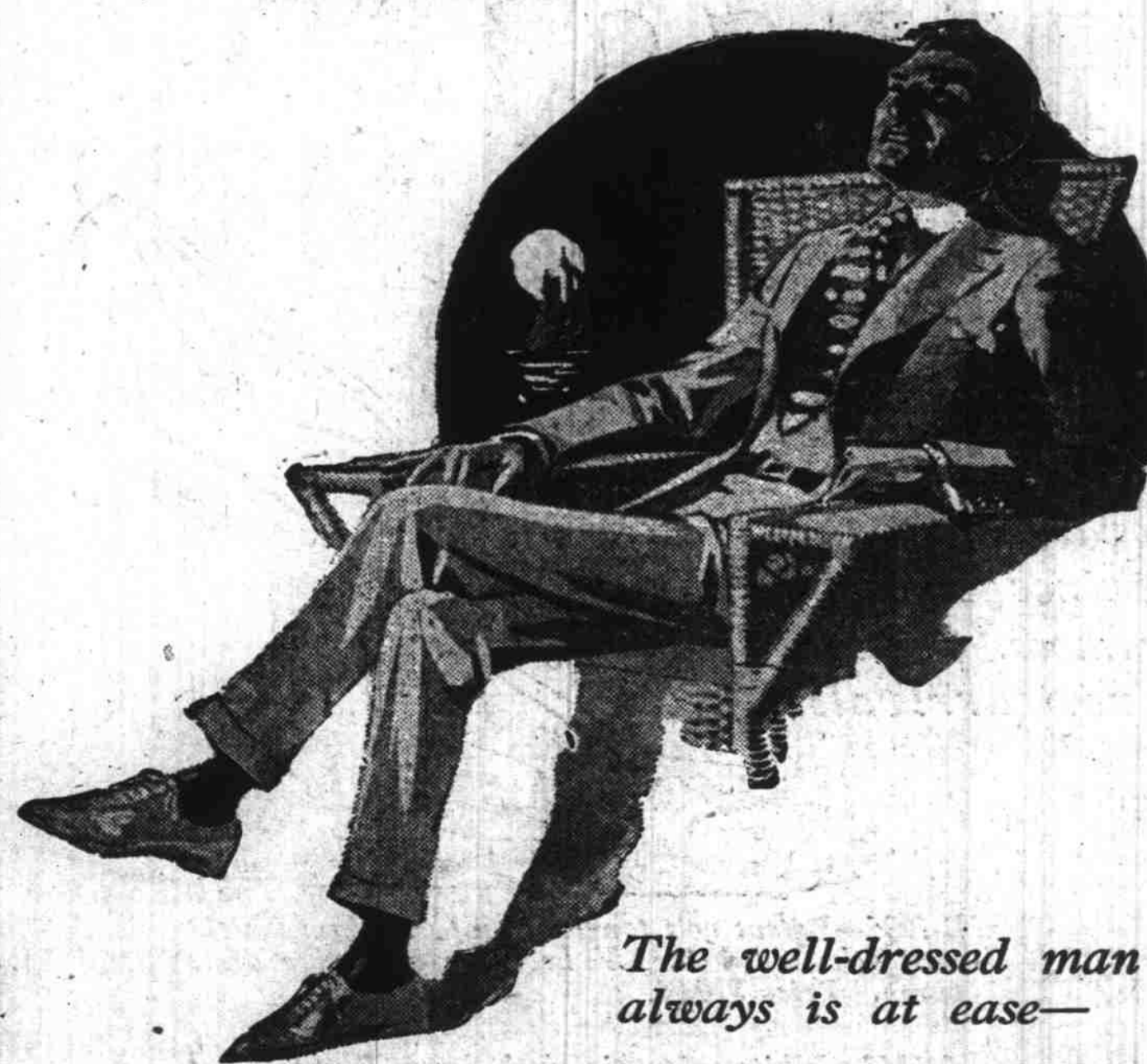
The well-dressed man always is at ease—

The men who wear the clothes I sell are well-dressed men. My label is a faithful guaranty of excellence in fabric, designing, workmanship.