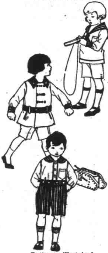
Suits as Sketched

—Great event, indeed! The two previous sales—one at the end of January and the other at the end of February—proved so successful, we are glad to be able to repeat them now! With the sunshine bringing out wash suits for little fellows, this is indeed an unusual opportunity to buy them at substantial savings!