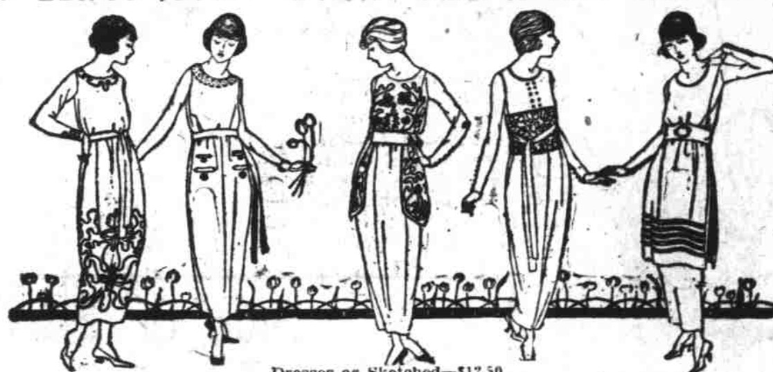
Dresses as Sketched—$12.50

—Some of the models are lavishly braid embroidered in self colors, while others have dainty touches of color in beading. All the wanted shades.