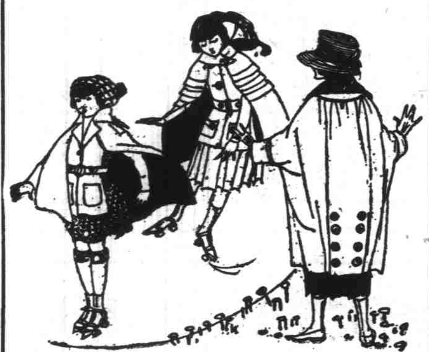
As Sketched $14.95

—Just when Fashion says, "Capes" and capes are the most fashionable of all wraps—and when Dolmans are so popular because they are so much like capes yet have the good features of coats—we are prepared to offer a sale of these most-in-demand wraps for girls and juniors at splendid savings. There is one coat-cape model with vest and belt that is unusually smart. Another is a youthful cape in all the smartest shades—rose, pekin, navy, tan, African, Alpine blue. The third is a Dolman model with deep yoke. Every cape is worth much, much more than $14.95!