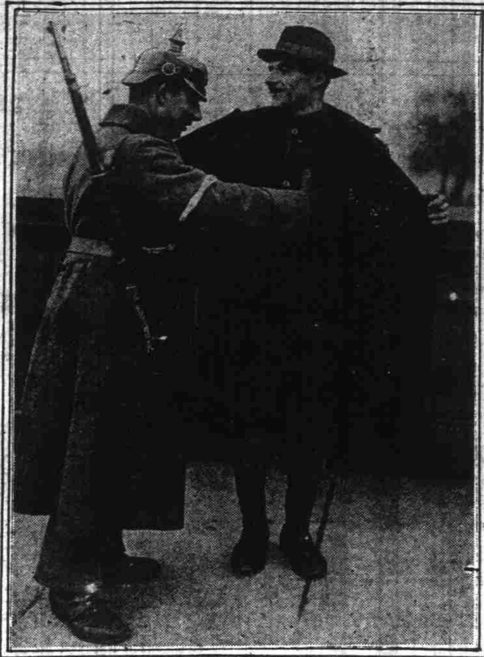
Following the downfall of the recent Spartacan uprising in Berlin, soldiers of the Ebert government stopped and searched in the streets civilians suspected of carrying concealed weapons. The photo shows a government soldier "frisking" a civilian for weapons.

accountant, auto and material checking. Clerk or office worker, experienced in inside work. Many Positions Open Employers in Portland and elsewhere, in this and other states, are asking today for the following men, among scores of others: Man familiar with irrigation—$75 a month and found. Salesman—commission basis. Auto garage night man—$23 a week and 25 cents bonus for every car washed; reference required. Boilers up—choice of three steel shipyards. Stenographer, one to take dictation—$100 and up. Auto mechanics and sheet metal workers. Teamster to drive eight horses up. Glass beveler—$5 for eight hours. Page for prominent Portland club—$80. Watchmaker—wage arranged. Railway conductors. Oakum spinner, wounded soldier can handle. Furniture workers, polisher, runner and varnisher—wages arranged.