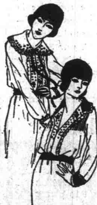
Sketched From Model on Sale

—Seven beautiful new Spring models in cotton blouses to be placed on sale for one day only at this remarkably low price.