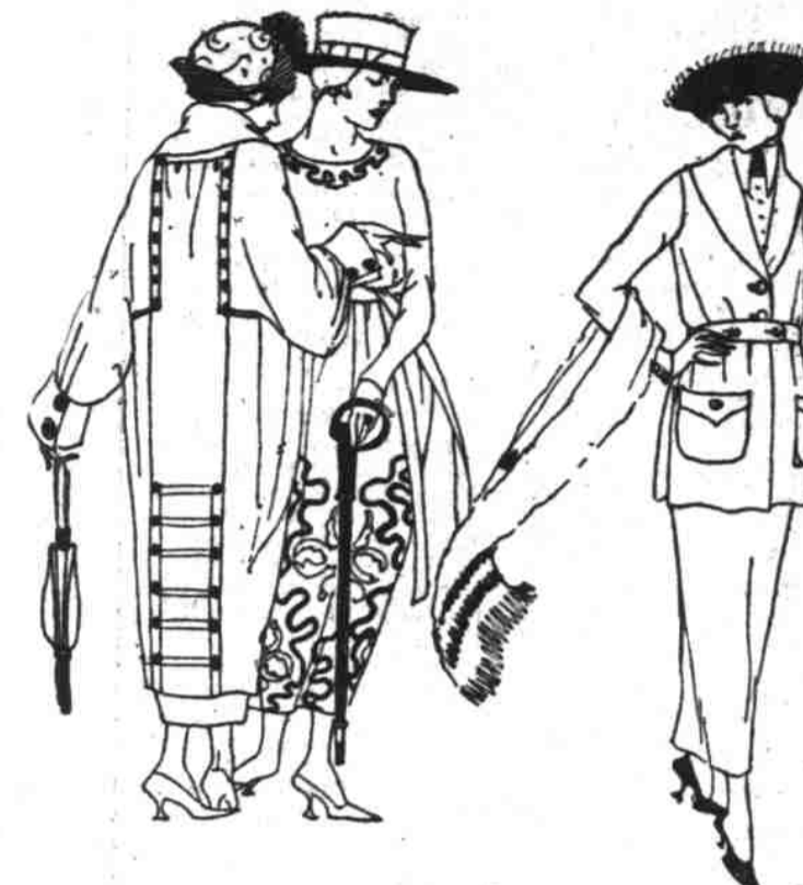
Garments as Sketched

—Splendid corsets made of pink coutil. Low bust style with elastic at waistline and free over hip. Long hips and back, a model suitable for slender and average figures. Sizes 21 to 28. —Economy Basement, Lipman, Wolfe & Co.