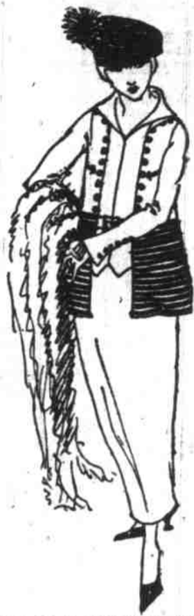
One Style Sketched—$36.50

—Suits that will astonish you with their quality, their style and the little unusual touches found ordinarily only on suits at far higher prices.