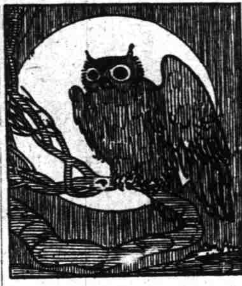
All was silent, except old Mother Owl, in the top of the big hemlock tree.

have a fair battle with the Beavers in the water, for in that case, the Beavers could have killed them. For the Foxes hate water, and they don't like to get their handsome red fur coats wet. They are great dandies, and are "stuck-up" about their beautiful and costly furs. So they sneaked up behind the big trees, very near the dam, to pounce upon the Beavers when they got out on the land to work on the dam. It looked very bad for the Beavers! But then, sometimes Beavers are smarter than foxes. A good many foxes had tried to catch Tom and Jerry Beaver, but they were such a bright pair of twins that they couldn't be caught. And neither could their mother and father and sisters and brothers. Tomorrow—The Foxes "Get Left."