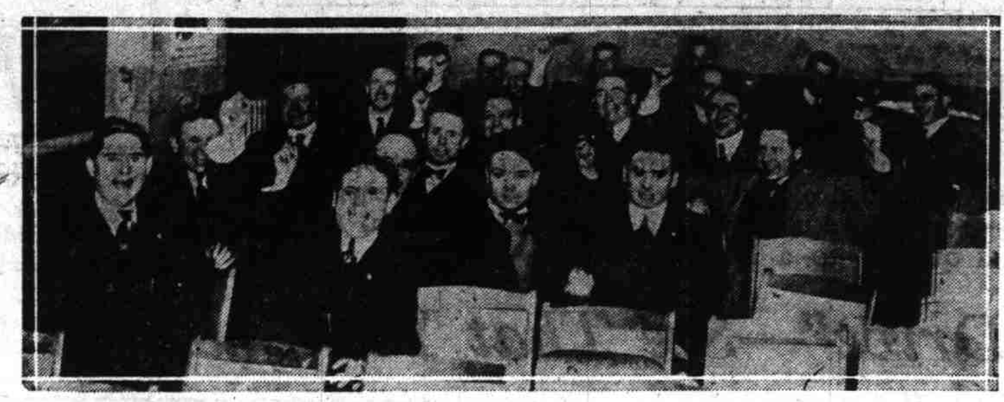
Group of Portland motor men enthusiastic over truck demonstration planned for Saturday evening. Flashlight photograph taken of conclusion of meeting Wednesday in Journal building auditorium.

How the motor truck, such a signal iccess in war, is to be made one of the greatest implements of peace will be shown in the Transport day parade demonstration next Saturday night. An enthusiastic meeting of motor truck men was held in The Journal auditorium Wednesday afternoon, when the subject was discussed from all angles. The following line of march was de-