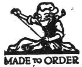
MADE TO ORDER

Catholic League to Meet The Catholic Women's League Red Cross auxiliary will meet Friday at 10 a. m. at 129 Fourth street in response to emergency orders for refugee garments. Full attendance of members is requested.