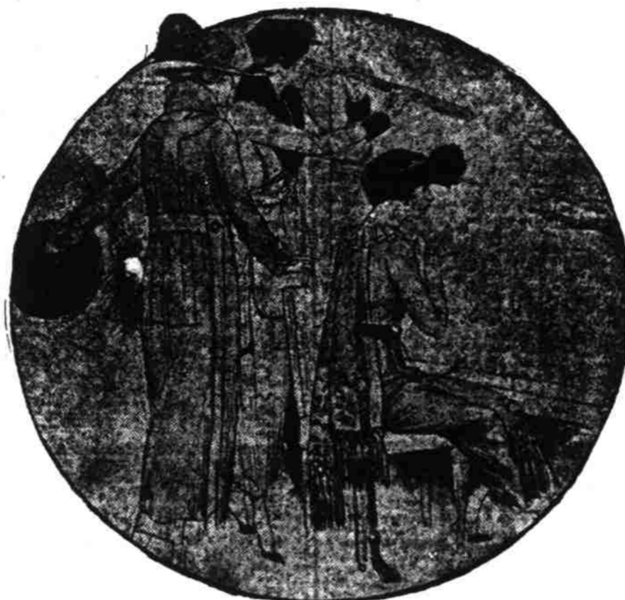
—Meier & Frank's: Apparel Shop, Fourth Floor.

Women's and misses' coats in dependable kerseys and velours. Full length models. Half lined. Large self, plush or kit cone fur collars. Navy, brown, taupe, green, burgundy and plum.