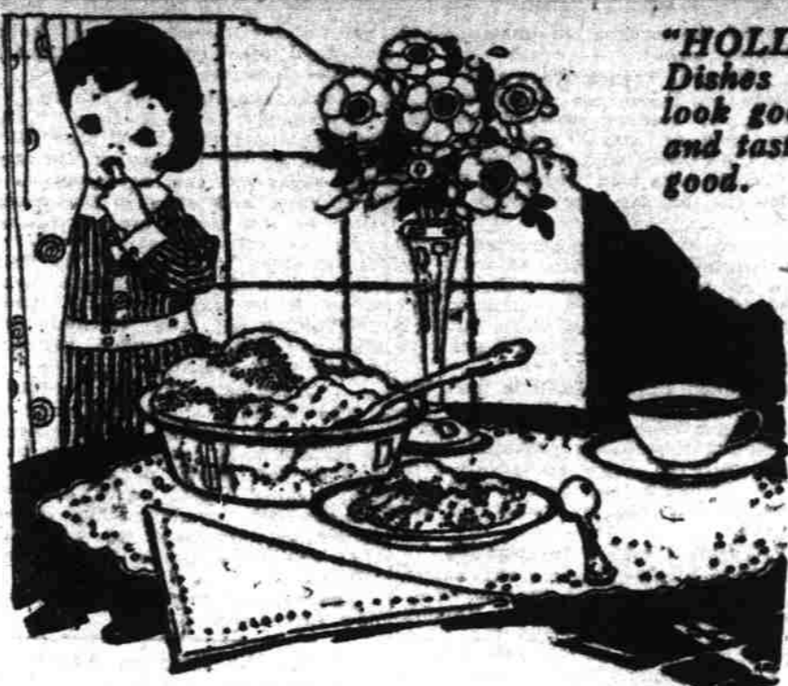
"HOLLY" Dishes look good and taste good.