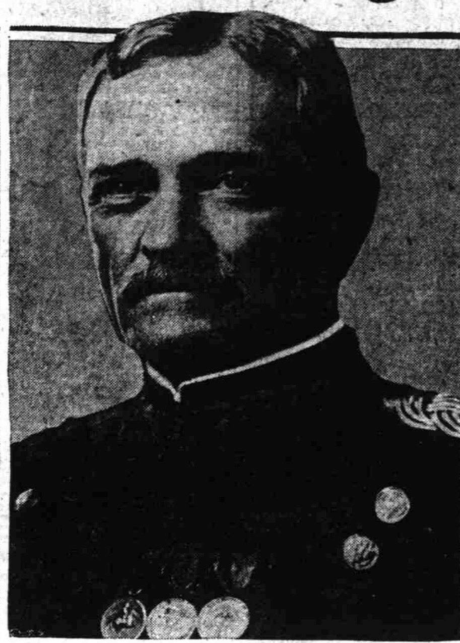
General Pershing, commanding American forces in France.