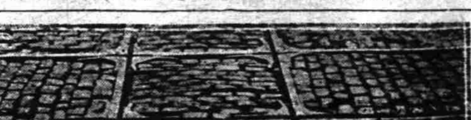
View of crossing at Twelfth and Glisan streets, showing dangerous condition of tracks and track pavement area. The city is now undertaking to hasten the work of repairing bad places of this character.