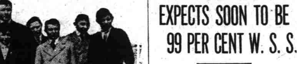
Thriving Organization Formed Monday; Young People to Entertain Soldier Boys.

A War Savings Stamp society that promises to include 99 per cent of the membership of the New Church society (Swedenborgian), was organized Monday evening in the church.