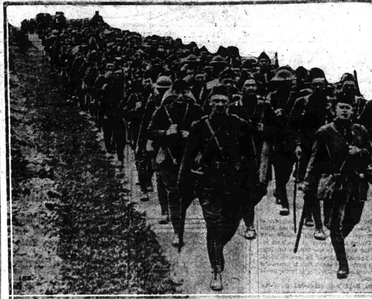
Some of the heroic American soldiers who are covering themselves with glory by their magnificent fighting qualities in the struggle with the Boche on the Marne, in Picardy and in Champagne.