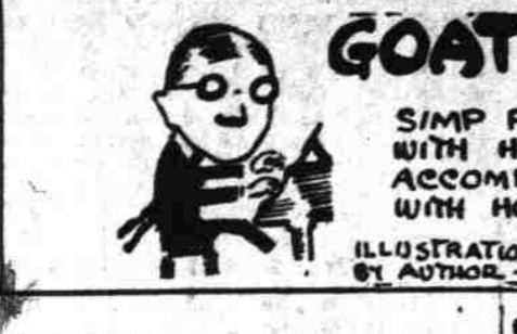
Illustration by author. JOE KING