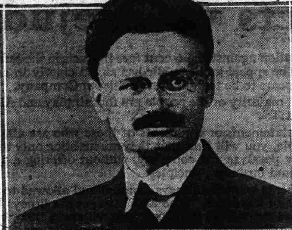
Signature du Titulaire