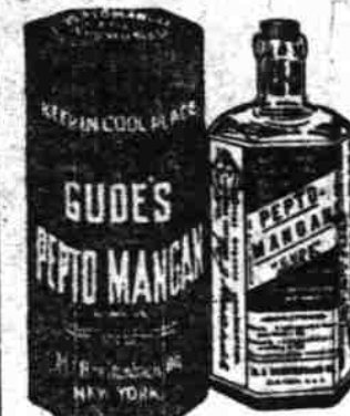
Study this picture so you will know how real Pepto-Mangan looks.

Have you lost weight? Are you easily worried and irritated? Do you have many "off-days"? Are you easily fatigued, and is your appetite poor? Are you pale?