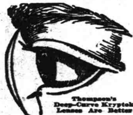
Thompson's Deep-Curve Kryptok Lenses Are Better