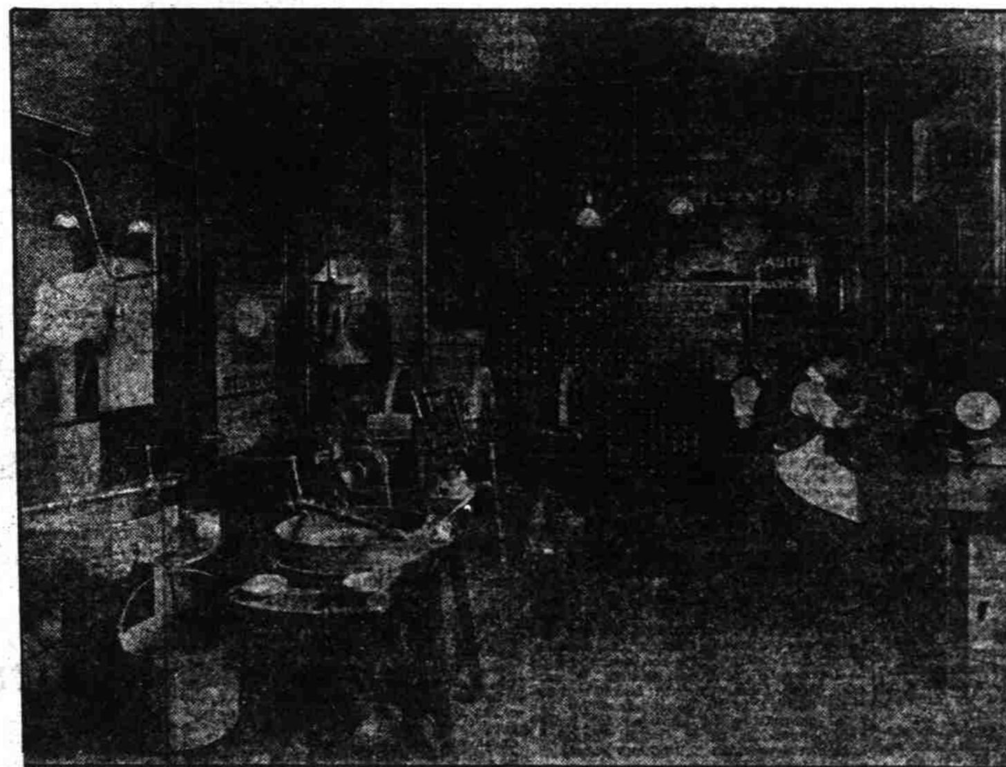
MANUFACTURING DEPARTMENT Here the Opticians Grind Your Lenses.