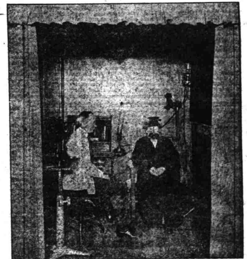
EXAMINING-ROOM NO. 2 (Newly Constructed and equipped) Here the Optometrist Examines Your Eyes.