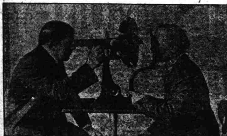
THE OPHTHALMOMETER measures Astigmatism, its kind, degree and axis. It is founded upon mathematical and philosophical laws and makes no mistakes.