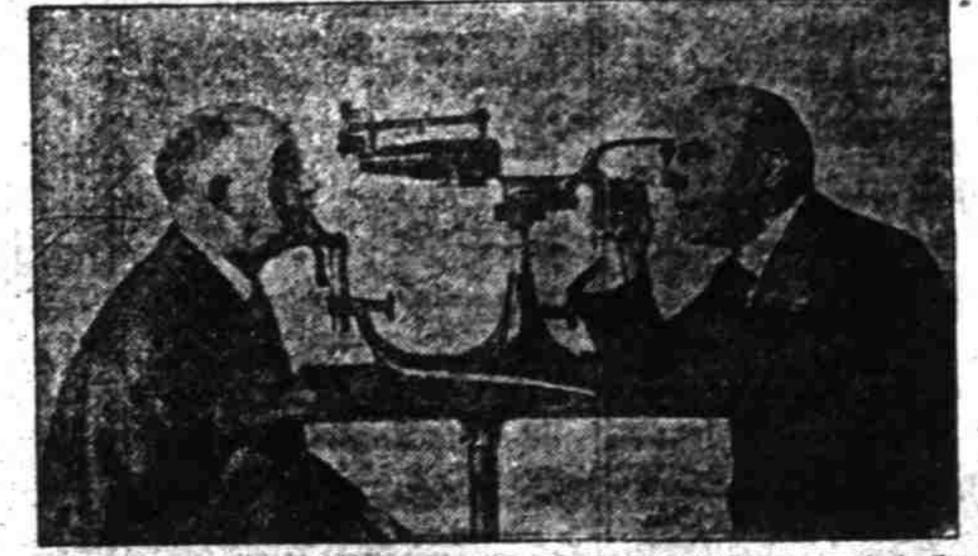
THE COMBINED RETINOSCOPE AND OPHTHALMOSCOPE reveals to the skilled operator the refractive power of the observed eye and shows him Nature at work by bringing to his view the pulsating blood vessels and the nerves as they receive and transmit the vibrations producing vision.

It is thoroughness like this in every process in the production of Thompson's glasses, from the initial blocking of the lens to the final test itself, which makes them the most dependable eyeglasses in existence.