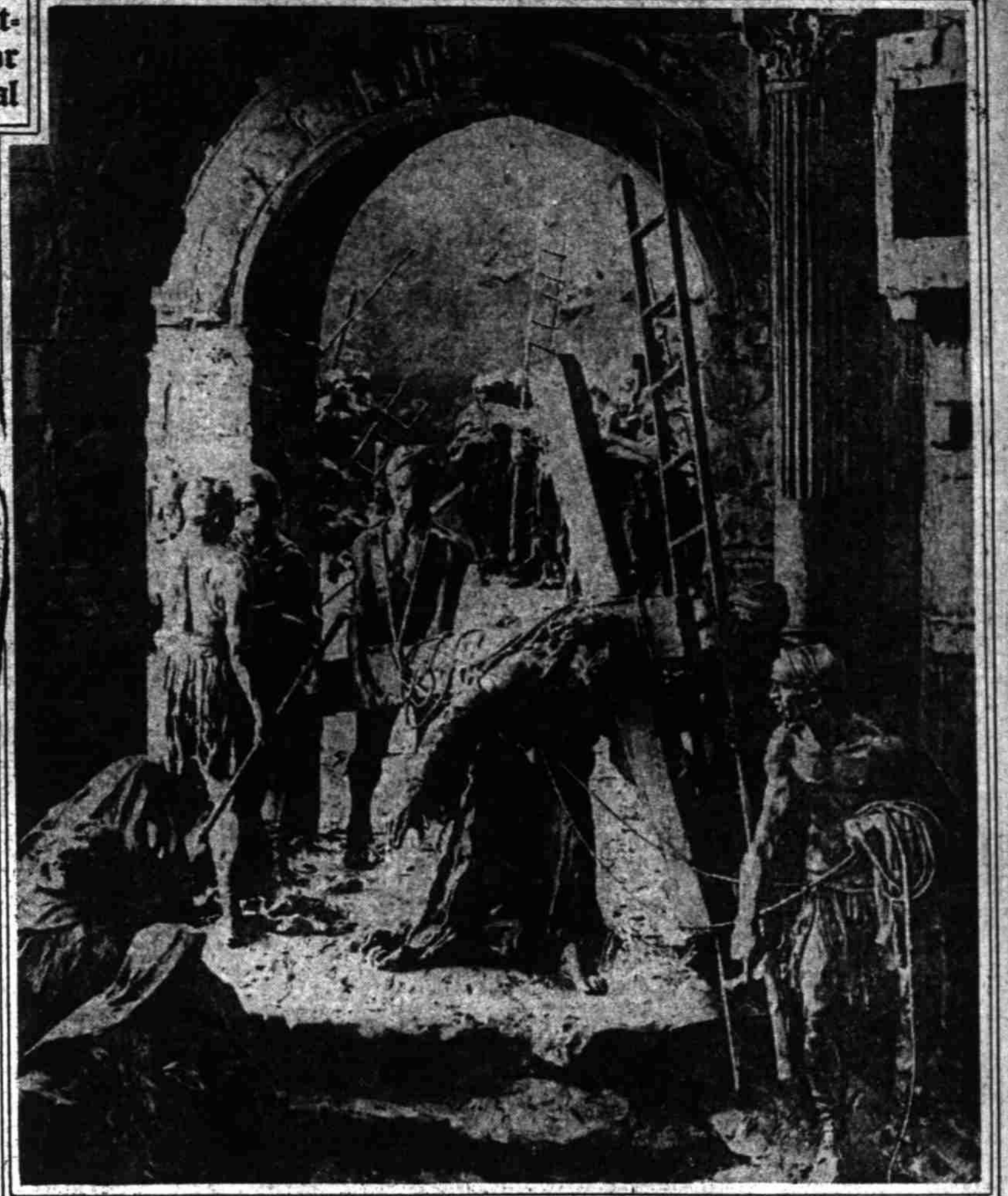
SIMON THE CYRENIAN HELPS CHRIST BEAR THE CROSS And Pilate . . . delivered Jesus to their will. And as they led him away, they laid hold on one Simon, a Cyrenian, coming out of the country, and on him they laid the cross, that he might bear it after Jesus.—Luke 23:24-26.