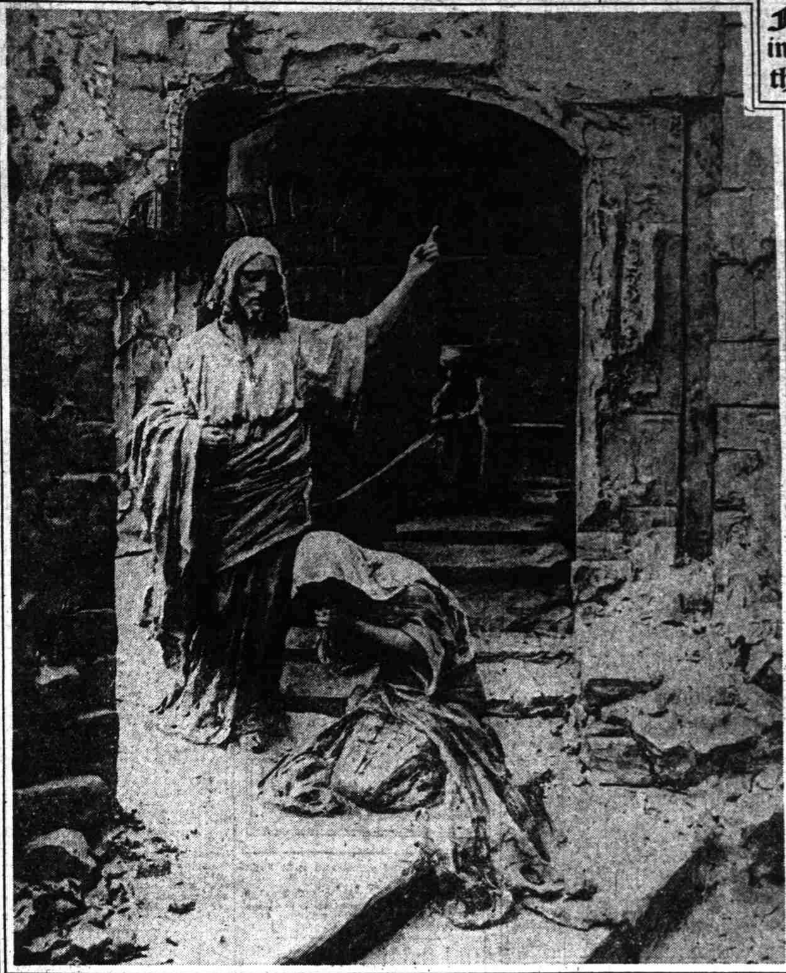
MARY MAGDALENE AT THE FEET OF CHRIST And the twelve were with him; and certain women which had been healed of evil spirits and infirmities, many called Magdalene, out of whom went seven devils. . . . and many others.—Luke 8:1-3.

Four of a series of groups depicting events in the life of The Savior that claim attention in international art circles.