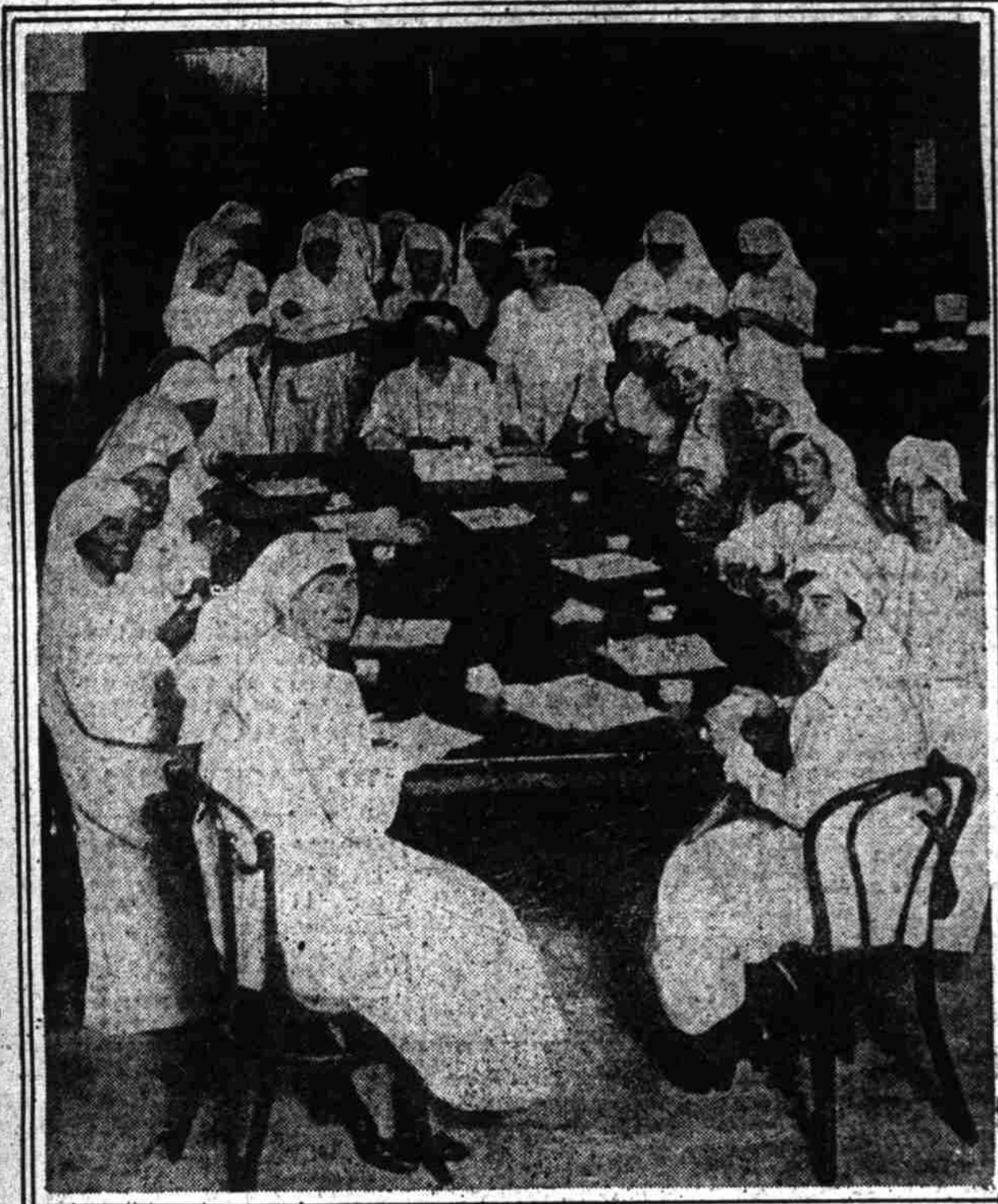
Scene in workroom of woman's bureau of the Portland chapter of the American Red Cross in the Lipman & Wolfe building, where the manufacture of surgical dressings and supplies is carried on on a large scale.