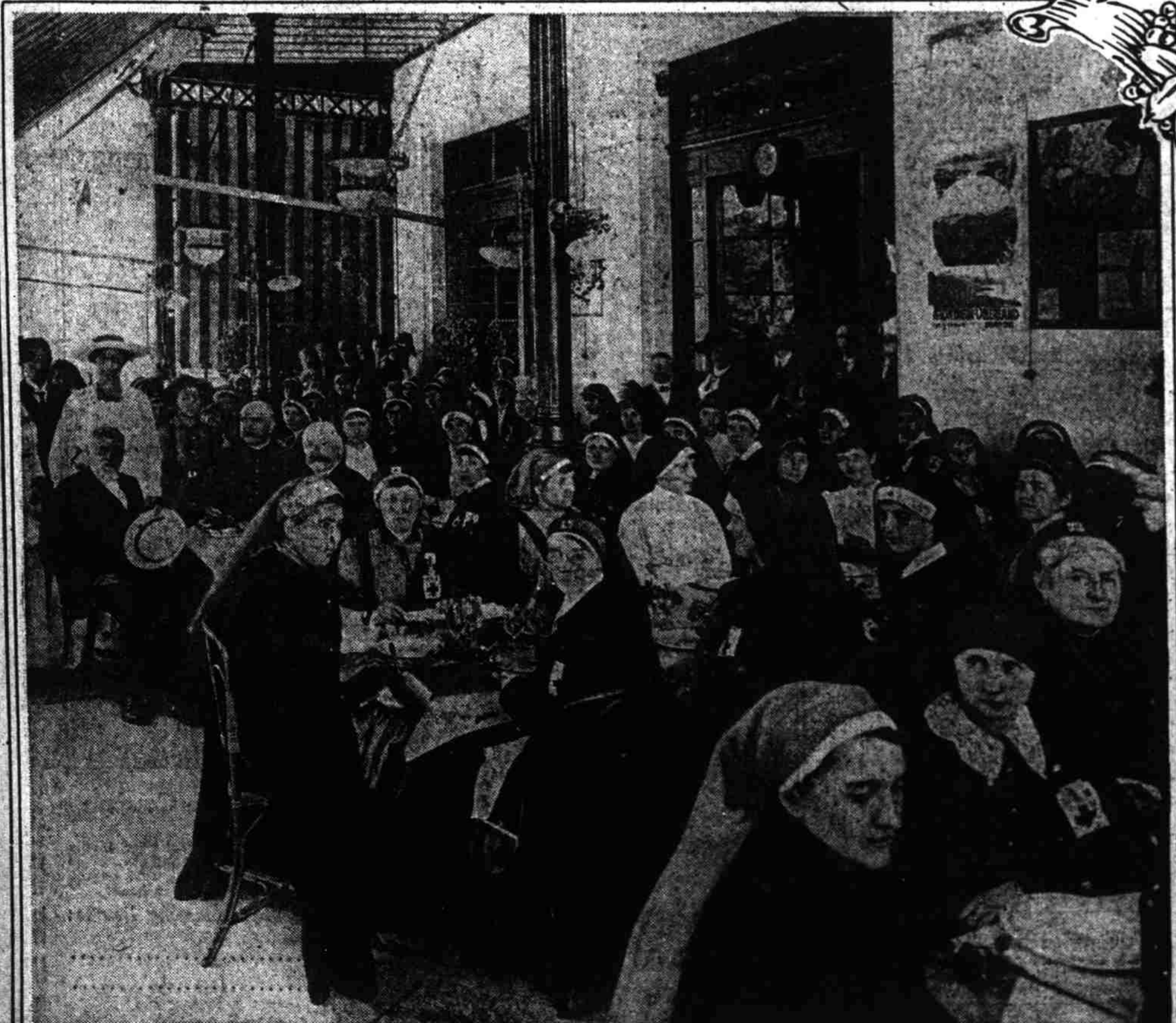
French nurses at Geneva. This Swiss city, like other centers in this neutral republic, is an oasis in the war desert, where wounded soldiers of the several belligerents, and civilian refugees, too, are cared for and sent back to their homes. The relief work done in Switzerland during the war is a happy page in the chronicle of the great disaster and women play a big part therein.