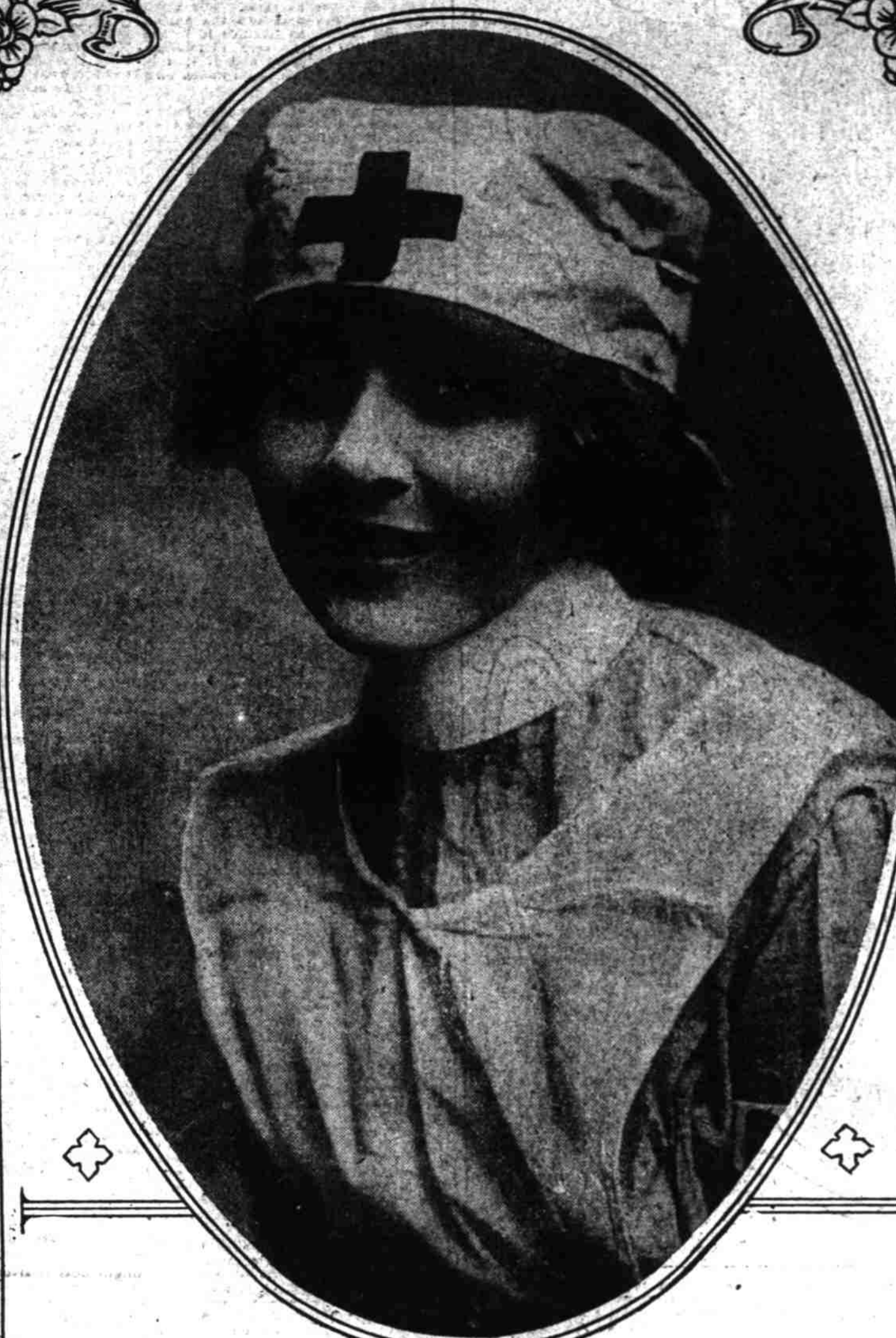
An angel of mercy. The alleviation of the sufferings of the battlefields is due in a large measure to the tender nursing performed in the war hospitals by trained women, whose work, like that of their sisters engaged in other lines of useful Red Cross endeavor both at home and abroad, is a willing sacrifice to the common cause.

IN 1864 delegates from 16 nations assembled at Geneva, Switzerland, and drew up a treaty of nine articles looking to the neutralization of hospitals, materials, nurses and surgeons in time of war and providing an emblem consisting in a red cross on a white field which won world-wide approval. The association was introduced in the United States by Miss Clara Barton in 1877 and President Arthur signed the Geneva treaty in 1882.