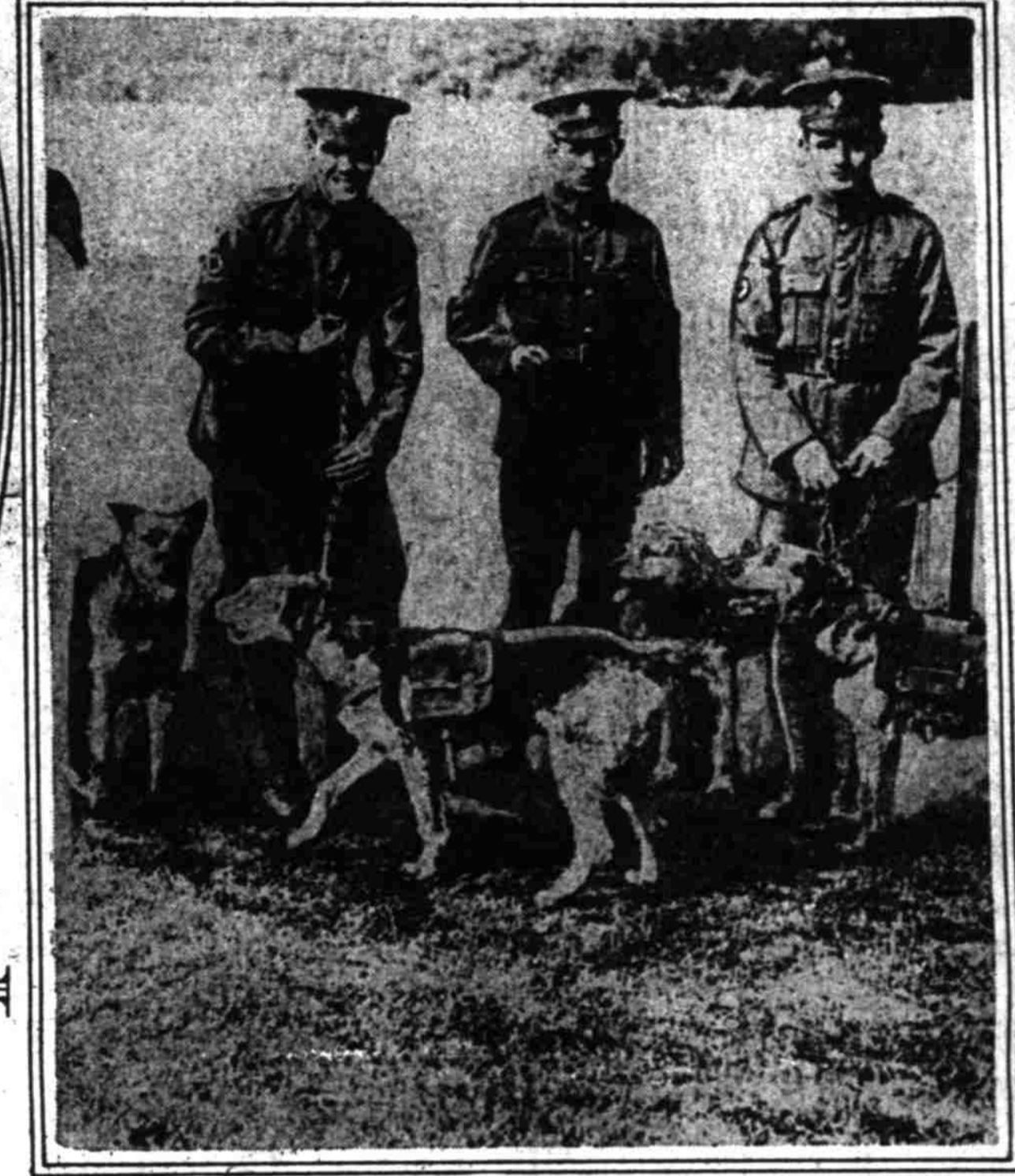
Real dogs of war, attached to the British army, which perform wonderful service in searching out wounded men and reporting their location. These dogs, which are mostly of Alredale and bloodhound breeds, show almost human intelligence.