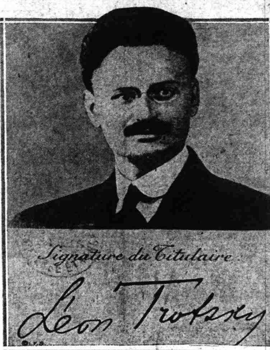
Leon Trotsky, Russian Maximalist leader, who hurried back to Russia from New York after the March revolution, to prepare for his recent bid for control.

of the New York east side and in Harlem contributed furniture for the house where he established himself in the Bronx, and it caused considerable feeling among them when he eventually left town in such haste that none of the contributors were notified, and the furniture was left to take care of itself in the empty house for a considerable time.